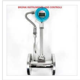
Air Flow Meter