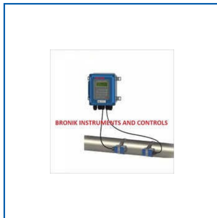
ULTRASONIC FLOW METER