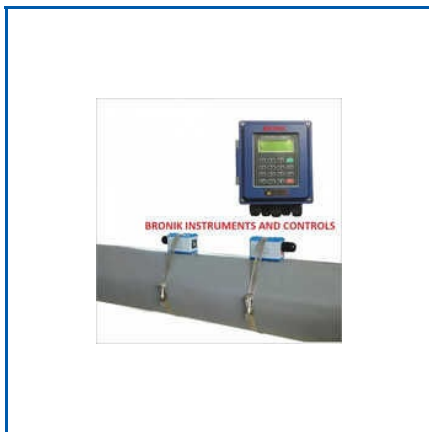
CLAMP TYPE ULTRASONIC FLOW METER

Air Flow Meter, Clamp Type Ultrasonic Flow Meter, Diesel Flow Meter, Diesel Flow Transmitter, Electric Flow Meter, Electro Magnetic Flow Meter, Gas Flow Meter, Hand Held Ultrasonic Flow Meter, Industrial Flow Meter, Industrial Ultrasonic Flow Meter, Magnetic Flow Meter, Oil Flow Meter, Oil Flow Sensor, Oil Flow Transmitter, Open Channel Flow Meter, etc.