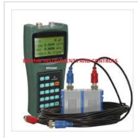
Hand Held Ultrasonic Flow Meter