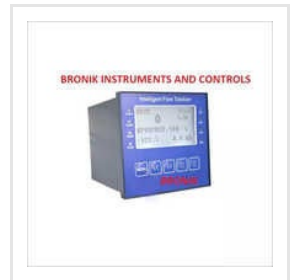
Oil Flow Transmitter