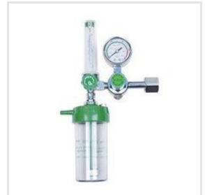
Oxygen Flow Meter