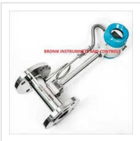
Steam Flow Meter