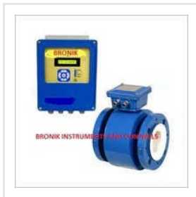
Magnetic Flow Meter