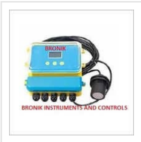
Open Channel Flow Meter