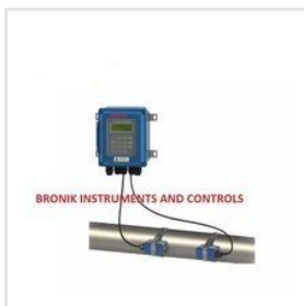
Ultrasonic BTU Meter