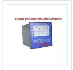
Diesel Flow Transmitter