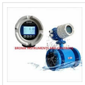
Electro Magnetic Flow Meter