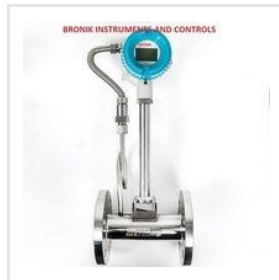
Vortex Flow Meter