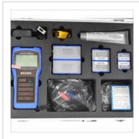
Industrial Flow Meter