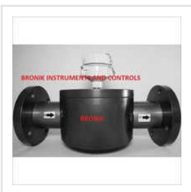
Diesel Flow Meter