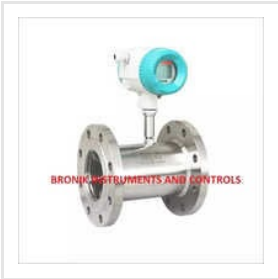
Oil Flow Meter