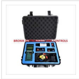
Industrial Ultrasonic Flow Meter