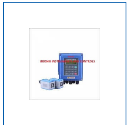
ELECTRIC FLOW METER