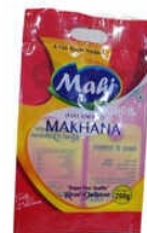
DRY FRUIT PACKAGING POUCH