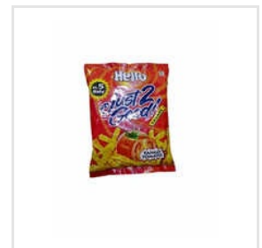
Kurkure Packaging Pouch