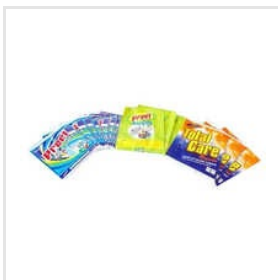
Printed Laminated Pouches