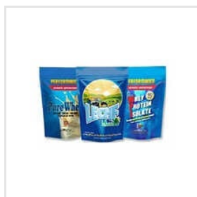
Flexographic Printed Pouches