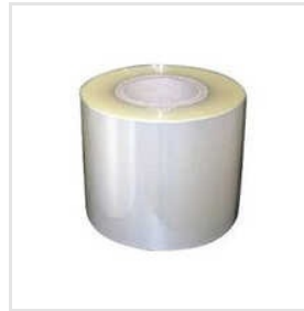
Transparent Packing Roll