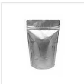
Standy Packaging Pouch