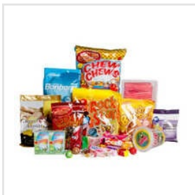
Namkeen Packaging Pouch