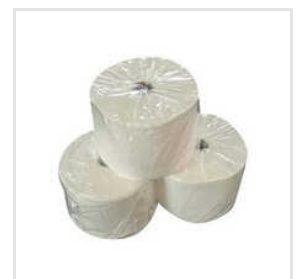
Plastic LD Bag Roll