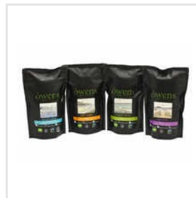
Multilayer Plastic Pouch