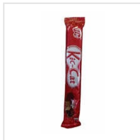
Chocolate Packaging Pouch