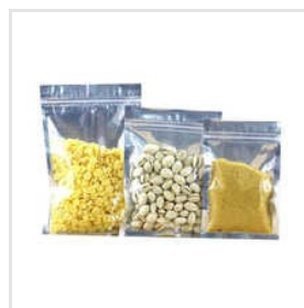
Transparent Packaging Pouch