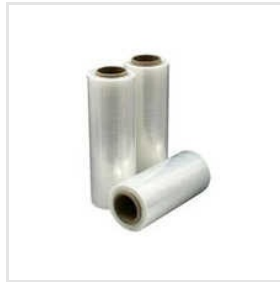
PP Packaging Pouch