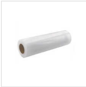
Plastic Packaging Pouch