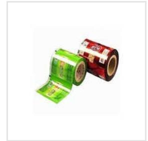
Printed Laminated Roll