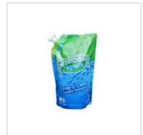
Detergent Packaging Pouch