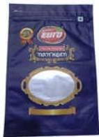
NAMKEEN PACKAGING POUCH

Chocolate Packaging Pouch, Confectionery Packaging Pouch, Detergent Packaging Pouch, Dry Fruit Packaging Pouch, Flexible Packaging Pouch, Flexographic Printed Pouches, Kurkure Packaging Pouch, Laminated Packaging Pouch, Lamination Packaging Roll, Multilayer Plastic Pouch, Namkeen Packaging Pouch, PP Packaging Pouch, Plastic Bag Printing Service, Plastic LD Bag Roll, Plastic Packaging Pouch, etc.