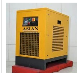
50 Hp Industrial Air Compressor