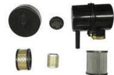
01_Reciprocating Spare Parts