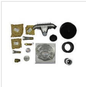
02_Reciprocating Spare Parts