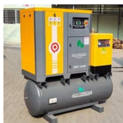
SMV 15KV 15HP Tmd Asian Air Compressor