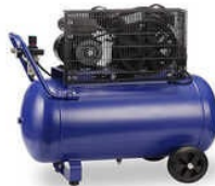
1-3 Hp Single Ph Portable Compressor