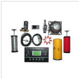
Screw Compressor Spare Part