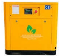
Asian 5HP Compressor