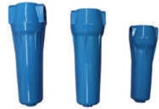
Air Compressor Line Filter