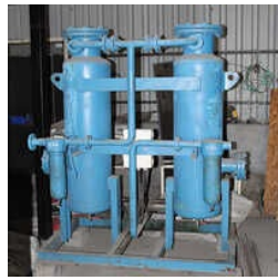
Heat Less Air Dryer