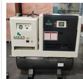
10 Hp Asian Piston Compressor