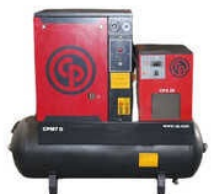
CP Air Compressor