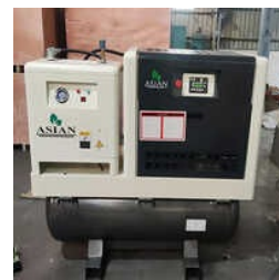
15HP Tmd Asian Air Compressor