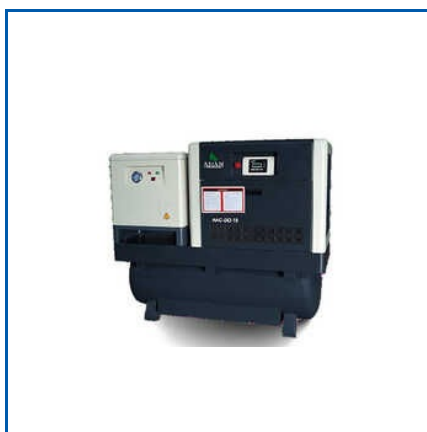
ASIAN TMD 10HP TANK MOUNTED SCREW AIR COMPRESSOR