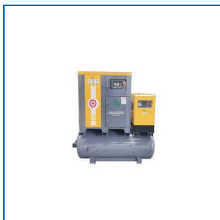
10HP SCREW AIR COMPRESSOR

01_Reciprocating Spare Parts, 02_Reciprocating Spare Parts, 1-3 Hp Single Ph Portable Compressor, 10 Hp Asian Piston Compressor, 10HP Air Compressor, 10HP Screw Air Compressor, 15HP Tmd Asian Air Compressor, 50 hp Industrial Air Compressor, AC 10TS Reciprocating Compressor, AC03TS Reciprocating Compressor, AC07TS Reciprocating Compressor, Air Compressor Line Filter, Air Oil Separator Filter, Asian 5HP Compressor, Asian Oil Filter, etc.