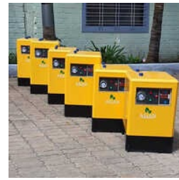
Refrigerated Air Dryer