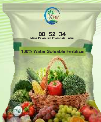
Mono Potassium Phosphate (mkp)