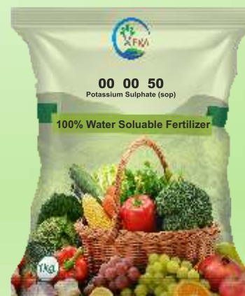
Potassium Sulphate (sop)