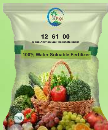
Mono Ammonium Phosphate (map)