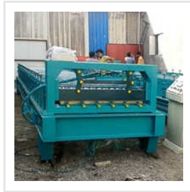
Liner Profile Sheet Roll Forming Machine