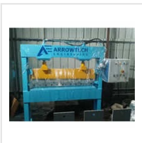
Roofing Sheets Manual Machine