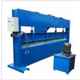
Hydraulic Sheet Bending Machine