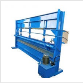
Sheet Bending Machine