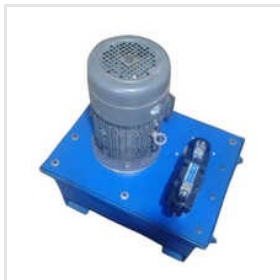
Electric Hydraulic Power Pack Machine