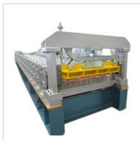
Roof Sheet Forming Machine