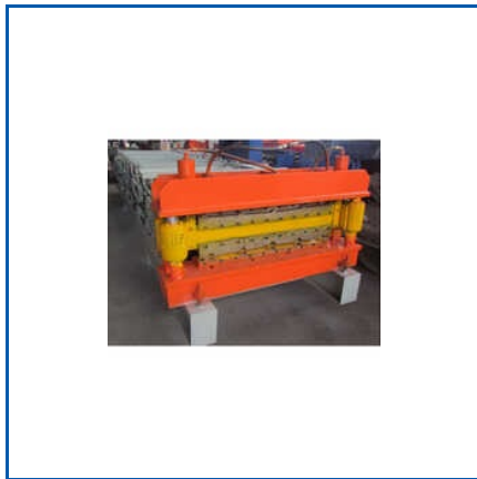
ROOF TILE MAKING MACHINERY