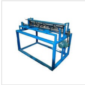
Roofing Sheet Slitting Machine