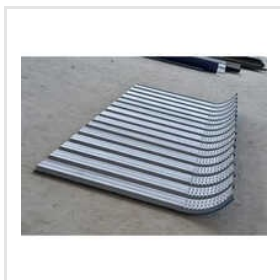
Hydraulic Metal Roof Sheet Crimping