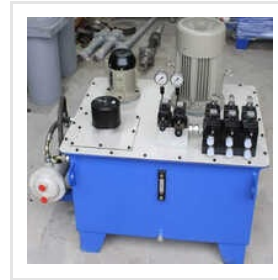
Hydraulic Power Pack