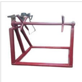
Manual De Coiler Machine