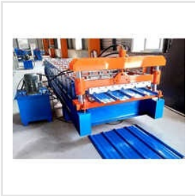
Metal Roofing Sheet Forming Machine