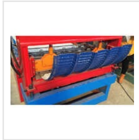
Roof Sheet Crimping Machine