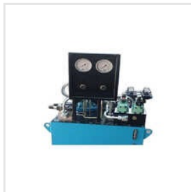
Hydraulic Power For Press