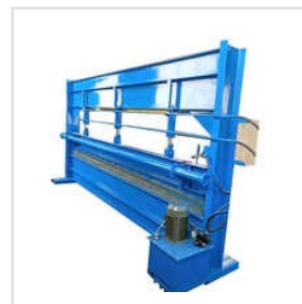
Sheet Roll Forming Machine