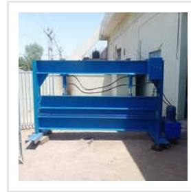
Sheet Cutting Machine