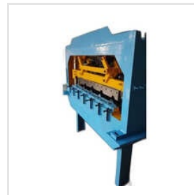
Manual Roofing Sheet Cutting Machine