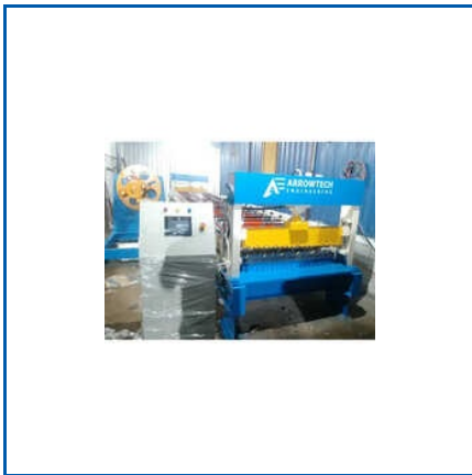
METAL ROOFING SHEET MAKING MACHINE

Colored Roofing Sheet Making Machine, Colour Sheet Making Machine Roller Assembly, Electric Hydraulic Power Pack Machine, Hydraulic Metal Roof Sheet Crimping Machine, Hydraulic Power For Press, Hydraulic Power Pack, Hydraulic Power Press Machine, Hydraulic Press Brake Machine, etc.