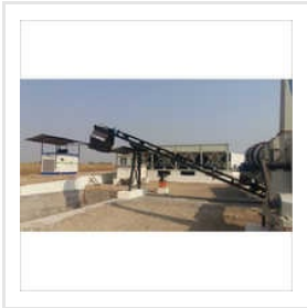
Asphalt Drum Mixing Plant