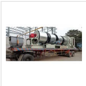
40 TPH Hot Mix Plant