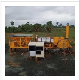
Automatic Mobile Asphalt Hot Mix Plant