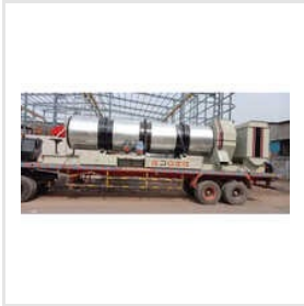
60 TPH Asphalt Hot Mix Plant