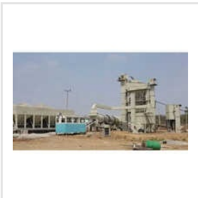
100 TPH Asphalt Batch Mix Plant