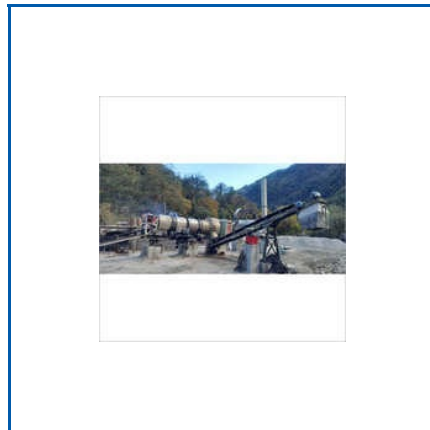
STATIONERY ASPHALT DRUM MIX PLANT