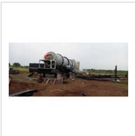
Stationary Hot Mix Plant