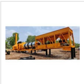
Road Construction Mobile Asphalt Hot Mix