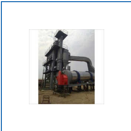
AUTOMATIC ASPHALT DRUM MIX PLANT

10 TPH Asphalt Hot Mix Plant, 100 TPH Asphalt Batch Mix Plant, 125kVA Asphalt Drum Mixing Plant, 30 TPH Asphalt Drum Mix Plant, 30 TPH Mobile Asphalt Hot Mix Plant, 30 Ton Bitumen Storage Tank, etc.