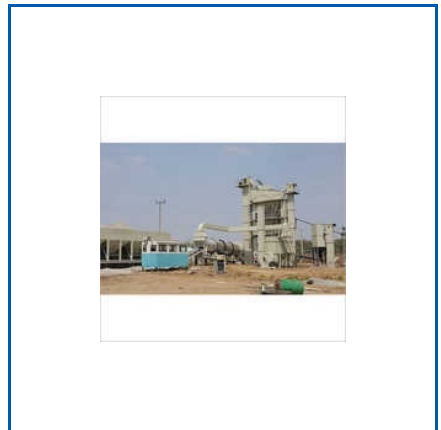
INDUSTRIAL ASPHALT MIXING PLANT