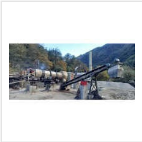
Fully Automatic Mobile Asphalt Hot Mix Plant