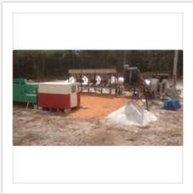
Mobile Asphalt Drum Mix Plant