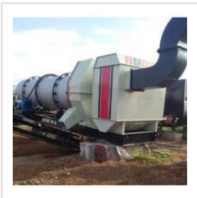
40 KW Automatic Hot Mix Plant