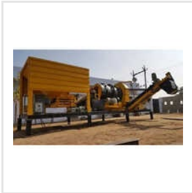
10 TPH Asphalt Hot Mix Plant