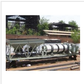
30 TPH Mobile Asphalt Hot Mix Plant