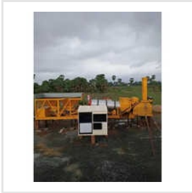
Mini Mobile Hot Mix Plant