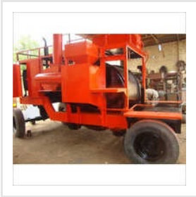
Mobile Hot Mix Plant