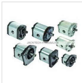
Hydraulic Gear Pump