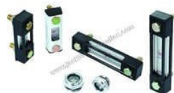
FLUID LEVEL INDICATOR

2 Way Solenoid Valve, Aluminium Bell Housing, Bell Housing / L Type Bracket, Danfoss Hydraulic Motor, Direction Control Valves, Dowty Gear Pumps, Flexible Jaw Coupling, Flow Divider Valve, Fluid Level Indicator, Gauge Isolator Hydraulic Valves, HA-10VSO 100 Variable Displacement Pump, HA-10VSO 140 Variable Displacement Pump, HA-10VSO 18 Variable Displacement Pump, HA-10VSO 28 Variable Displacement Pump, HA-10VSO 45 Variable Displacement Pump, etc.