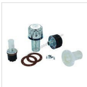
Hydraulic Tank Filler