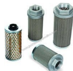
HYDRAULIC SUCTION STRAINER