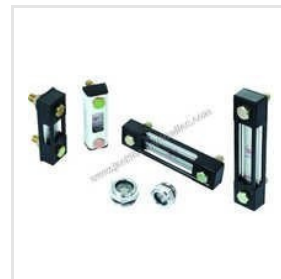
Fluid Level Indicator