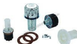
HYDRAULIC TANK FILLER BREATHERS