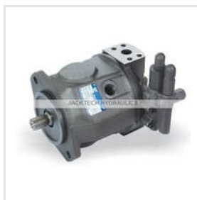
HA-10VSO 45 Variable