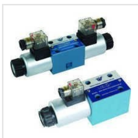
Pilot Operated Solenoid