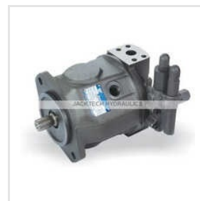
HA-10VSO 71 Variable