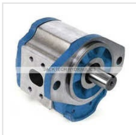
Hydraulic Gear Pump