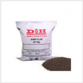
Maxflux SAF-7S Flux