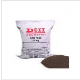
Maxflux SAF-13 Flux