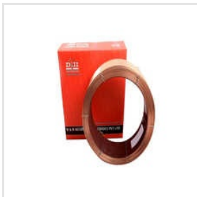
Autotherme Grade 347 SAW Wire