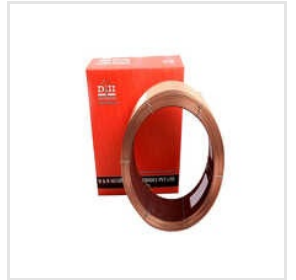
Autotherme Grade- 309L SAW Wire