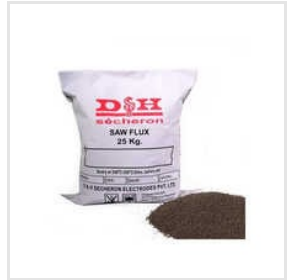
Maxflux ESF-1 Flux