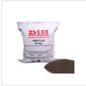
Maxflux HF-300 Flux