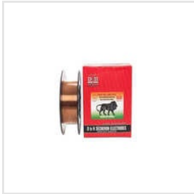
Autotherme C Mo Solid Wires