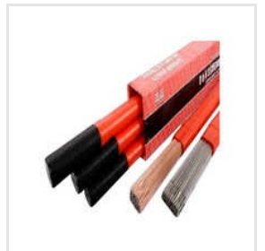
F Cr-Mo 2 Low Alloy Steel Wire