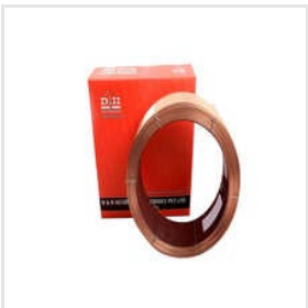
Autotherme Grade B SAW Wire