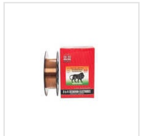
Autotherme Cr-Mo 9 Solid Wires