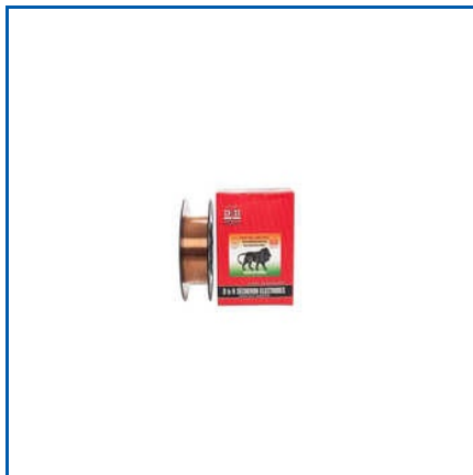
AUTOTHERME CR-MO 1 SOLID WIRES