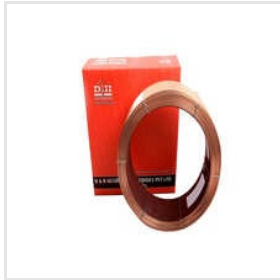
Autotherme Grade-G SAW Wire