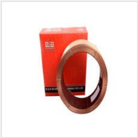
Autotherme Grade N SAW Wire