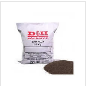
Maxflux SAF-11 Flux