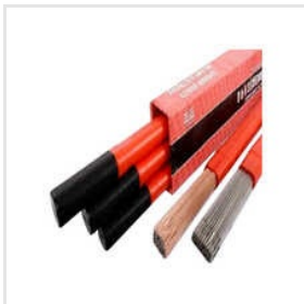
F Cr-Mo 23 Low Alloy Steel Wire