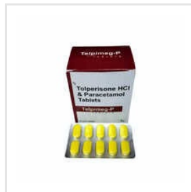
Tolperisone Hcl Paracetamol Tablets