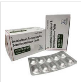
Aceclofenac Paracetamol And