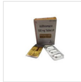
500mg Azithromycin Tablets