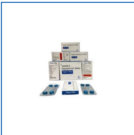
20MG HCl TABLETS

0.25mg Pramipexole Dihydrochloride Tablets, 1.5gm Ceftriaxone And Sulbactam For Injection, 100mg Acebrophylline Capsule, 100mg Cefixime Tablets, 100mg Progesterone Soft Gelatin Capsules, 100ml Ambroxol HCL Levosalbutamol Sulphate And Guaiphenesin Syrup, 100ml Chlorhexidine Gluconate Solution Sodium Mouth Wash, 100ml Hydrobromide Chlorpheniramine Maleate And Hydrochloride Cough Syrup, etc.