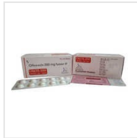
Ofloxacin Tablets IP