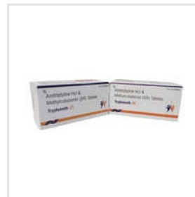
25mg Hcl Methylcobalamin