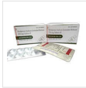
250mg Divalproex Sodium Extended