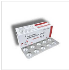
Torsemide And Spironolactone Tablets