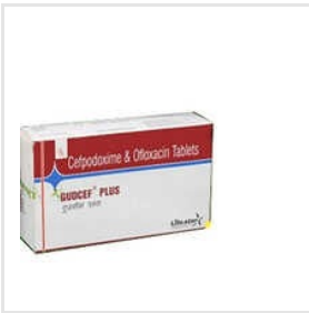
Cefpodoxime And Ofloxacin Tablets