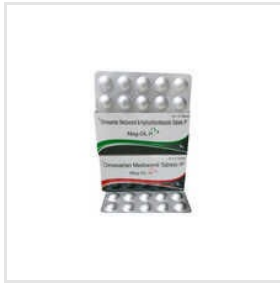
20mg Olmesartan Medoxomil And