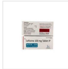
100mg Cefixime Tablets