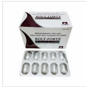
Methylcobalamin Alpha Lipoic Acid Folic