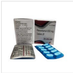
650mg Paracetamol Tablet