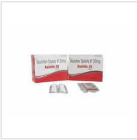
200mg Baclofen Tablets