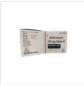
250mg Azithromycin Tablets