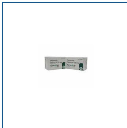
20MG TORSEMIDE TABLETS IP