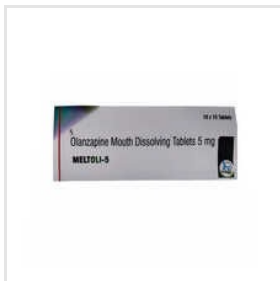
5mg Olanzapine Mouth Dissolving Tablets