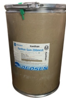
Xanthan Gum 200 Mesh