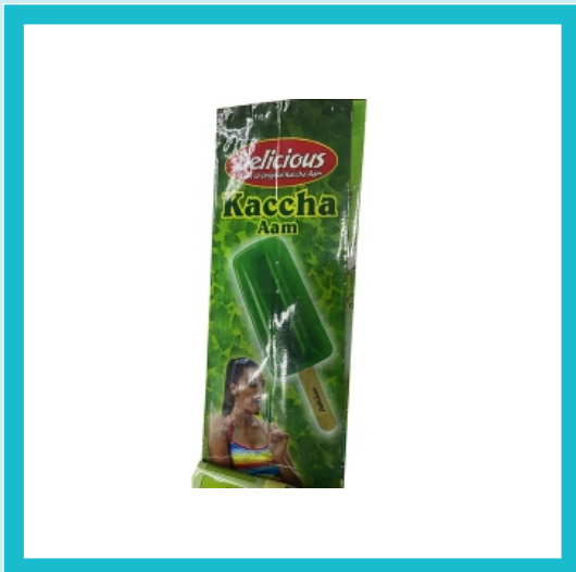
Kaccha Aam Ice Cream