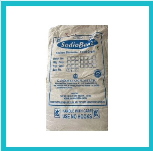
Sodium Benzoate-Food Grade