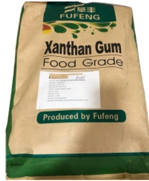
Xanthan Gum Food Grade