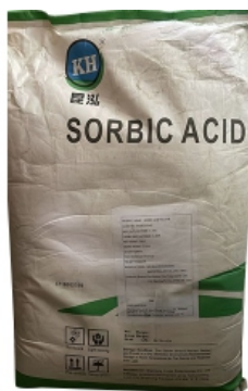
25 KG Sorbic Acid