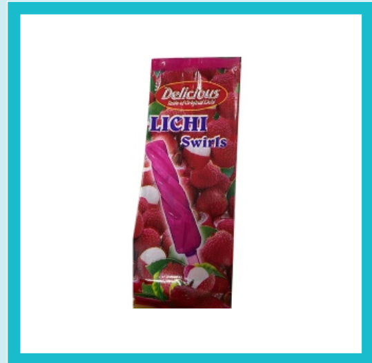
Lichi Swirls Ice Cream