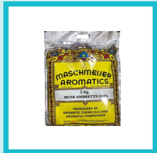
Aromatic Chemical And Aromatic Compound