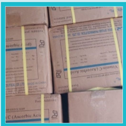
Vitamin C Ascorbic Acid