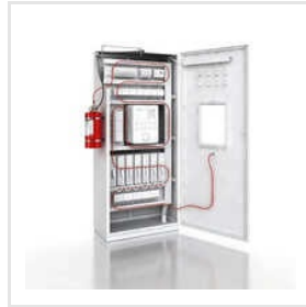
Fire Suppression Tubing System