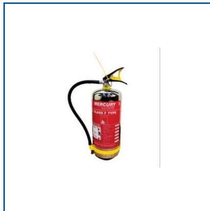
K TYPE KITCHEN FIRE EXTINGUISHER