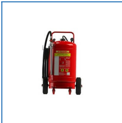
TROLLEY MOUNTED FIRE EXTINGUISHER

2 Inch Reflective Tape, 4.5 Kg Co2 Fire Extinguisher, A3 Smoke Detector Tester, A5 Solo Smoke Detector Tester, ABC Trolley Mounted Fire Extinguisher, AFO Fire Extinguisher Ball, Abc Powder Fire Extinguisher, Alcohol Detector, Aluminised Fire Safety Shoes, Aluminized Fire Suit, Anti Skid Tape, Automatic Modular Fire Extinguisher, Ball Valve, Barricading Caution Tape, Barricading Tape, etc.