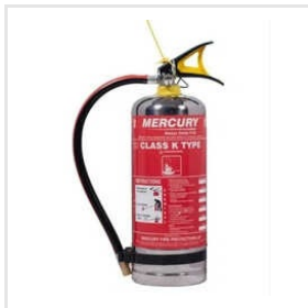
Kitchen Fire Extinguisher