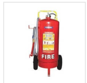
ABC Trolley Mounted Fire Extinguisher