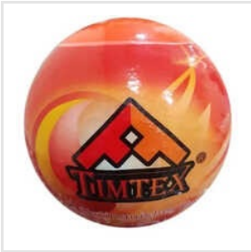
AFO Fire Extinguisher Ball