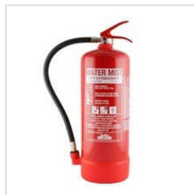
Water Mist Fire Extinguisher