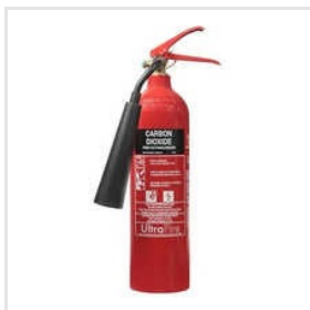
CO2 Fire Extinguisher