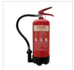
Foam Fire Extinguisher