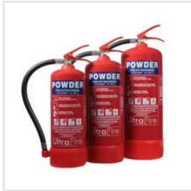
ABC Powder Fire Extinguisher