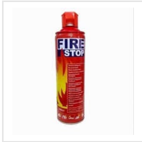
Portable Fire Extinguisher Spray