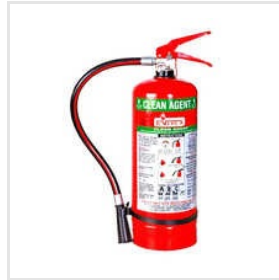
Clean Agent Fire Extinguisher