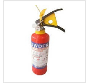
Car Fire Extinguisher