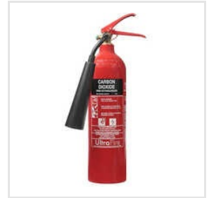
CO2 Fire Extinguisher