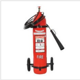
CO2 Trolley Mounted Fire Extinguisher