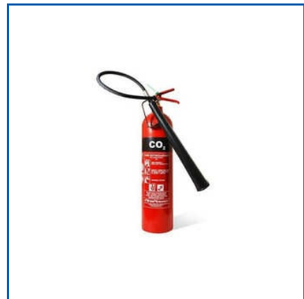
4.5 KG CO2 FIRE EXTINGUISHER