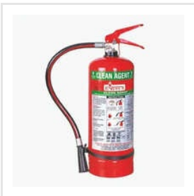
Clean Agent Fire Extinguisher