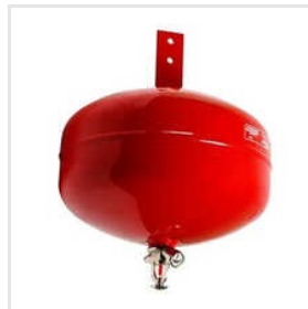
Automatic Modular Fire Extinguisher