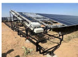
FULLY AUTOMATIC DRY CLEANING ROBOT