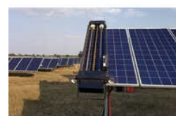
SB-04T DRY CLEANING ROBOT FOR TRACKER