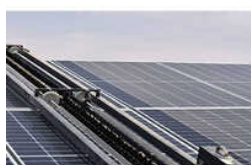
SB-03 SEMI AUTOMATIC DRY CLEANING ROBOT

Fully Automatic Dry Cleaning Robot, Realtime Monitoring Control, SB-01 Automatic Dry Cleaning Robot, SB-03 Semi Automatic Dry Cleaning Robot, SB-04T Dry Cleaning Robot For Tracker, SB-RT Rooftop Cleaning Robot, etc.