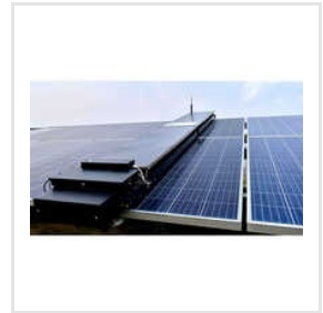
SB-01 Automatic Dry Cleaning Robot