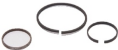
Sintered Piston Rings