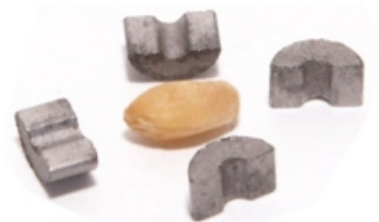
Sintered Part As Small As a Grain