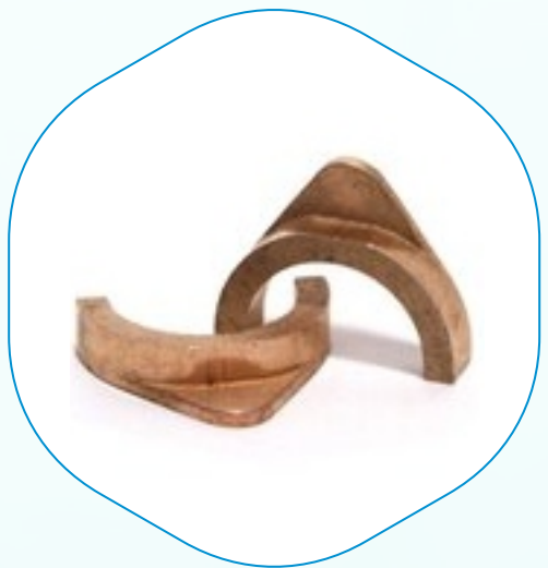
Sintered Component for Electric Motor