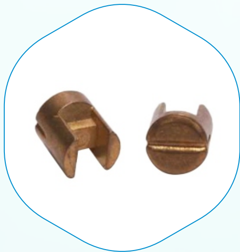
Sintered 3 Wheeler Clutch Pivot