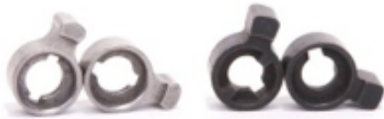
Sintered Cam for Lock