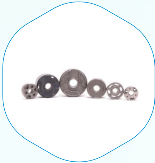
Sintered Shock Absorber Piston