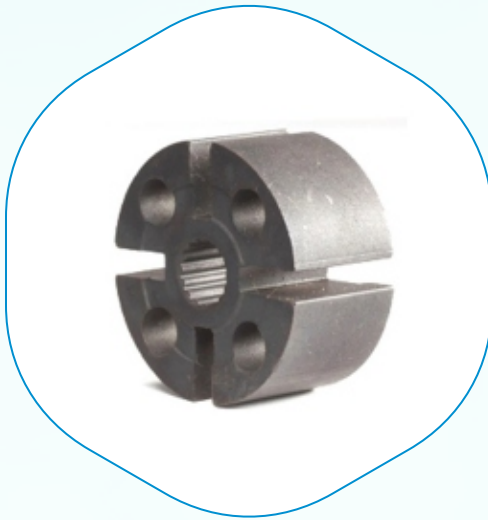
Sintered Vacuum Rotor