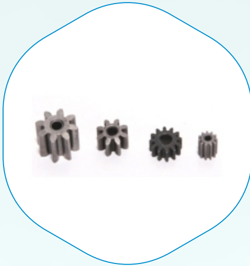
Sintered Small Gears