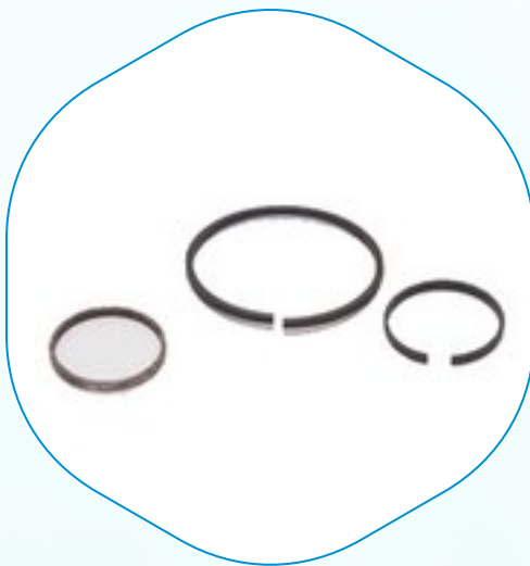
Sintered Piston Rings