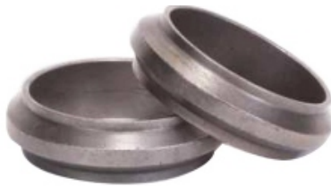
Sintered Automotive Exhaust Gasket