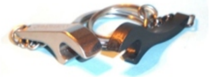
Sintered Bottle Opener for Key Ring