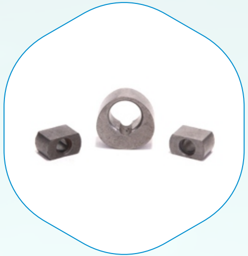
Sintered Textile MC Component