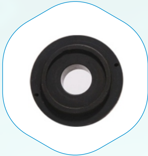
Sintered Shock Absorber Guide