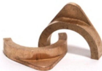
Sintered Component for Electric Motor