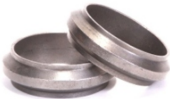
Sintered Exhaust Gasket