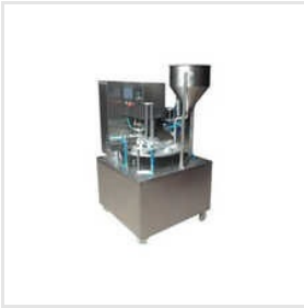
Semi Automatic Cup Filling Machine