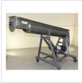
Stainless Steel Screw Conveyor