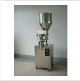
Semi Automatic Powder Filling Machine