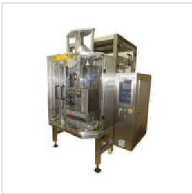
Form Fill Seal Machine