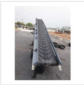
Truck Loading Conveyor