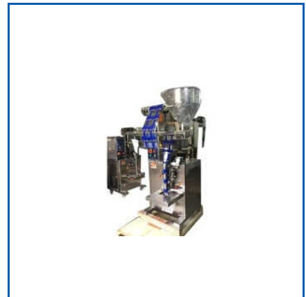
AUTOMATIC POUCH PACKING MACHINE