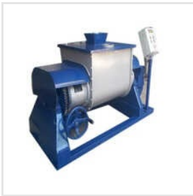
Industrial Sigma Mixer Machine