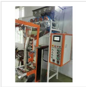
Fully Automatic Vertical Pouch Packing