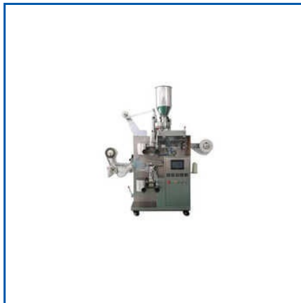
TEA BAG PACKING MACHINE