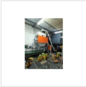
50 Kg Bagging Machine