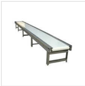
Machine Feeding Belt Conveyor