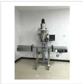
Semi Automatic Auger Filling Machine