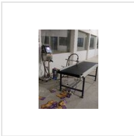
Mild Steel Vibrating Conveyor