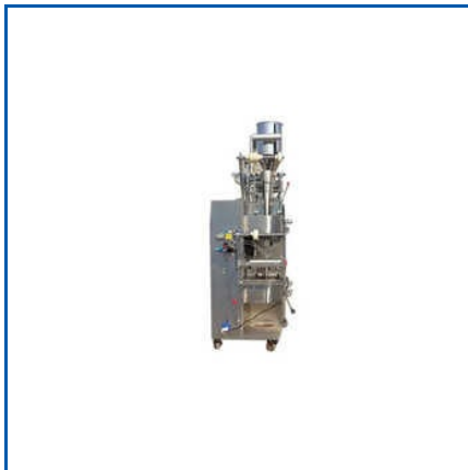
AUTOMATIC SPICES PACKING MACHINE

50 Kg Bagging Machine, Automatic Atta Packing Machine, Automatic Pouch Packing Machine, Automatic Spices Packing Machine, Bagging Filling Machine, Belt Conveyors, Continuous Band Sealing Machine, Form Fill Seal Machine, Fully Automatic Vertical Pouch Packing Machine With Linear Weigh Filler, etc.