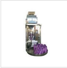
Automatic Atta Packing Machine