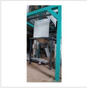
Bagging Filling Machine