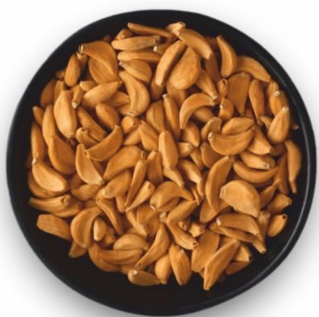
Flakes / Cloves