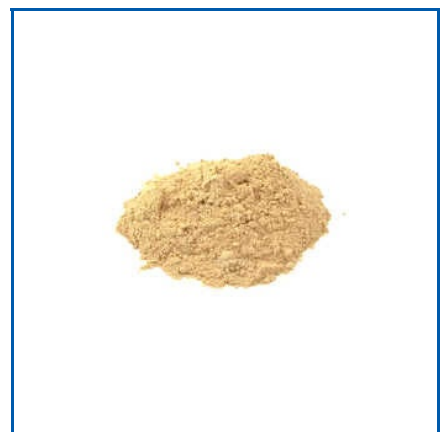
FOUNDRY FLUXING POWDER