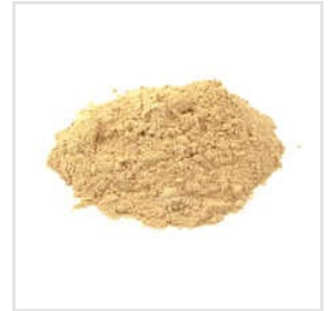
Foundry Fluxing Powder