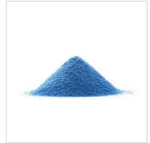
Furnace Wall Cleaning Fluxes