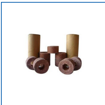
COPPER DEGASSER TABLETS

Aluminium Cover Flux, Aluminum Drossing Flux, Brass Foundry Fluxes Powder, Cleaning Flux Powder, Copper Degasser Tablets, Cover Flux Powder, Degasser Tablets, Drossing Foundry Flux Powder, FLUXIT-Foundry Flux And Cover Flux, Forcast Mass, Foundry Fluxes, Foundry Fluxing Powder, Furnace Wall Cleaning Fluxes, Insu-Line Coil Coat Powder, Neobor Borax Pentahydrate, etc.