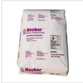
Neobor Borax Pentahydrate