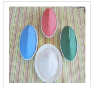
Drossing Foundry Flux Powder