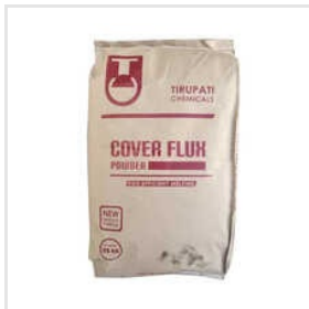
Cleaning Flux Powder