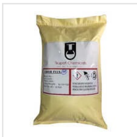
Brass Foundry Fluxes Powder