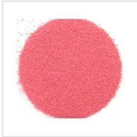
Aluminum Drossing Flux