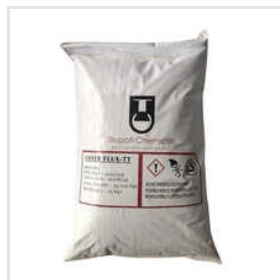
Cover Flux Powder