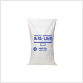
Insu-Line Coil Coat Powder