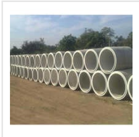
Flush Joint Pipes