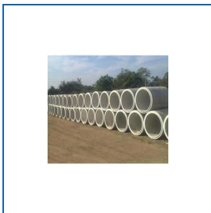
FLUSH JOINT PIPES