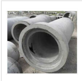
Spigot And Socket Pipes