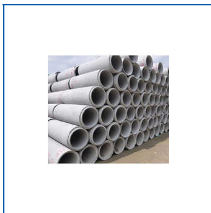
PLAIN ENDED PIPES