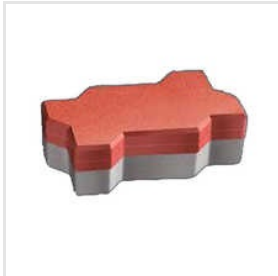
Industrial Interlocking Tiles