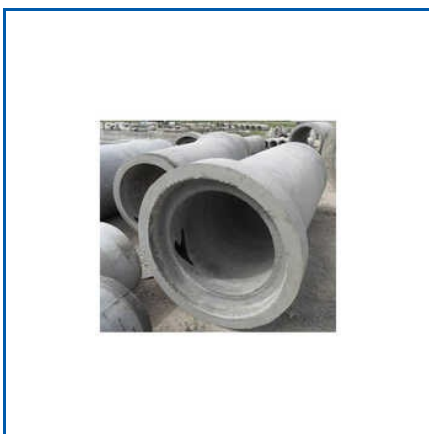
SPIGOT AND SOCKET PIPES

Commercial Precast Boundary Wall, Flush Joint Pipes, Industrial Interlocking Tiles, Plain Ended Pipes, Round RCC Manhole Cover, Spigot And Socket Pipes, Square RCC Manhole Cover, etc.