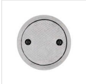
Round RCC Manhole Cover