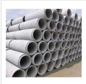
Plain Ended Pipes