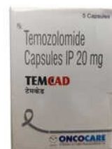
20 MG Temozolomide Capsules IP