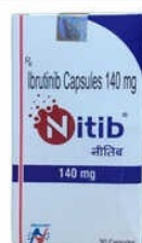
140 MG Ibrutinib Capsules