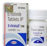
150 MG Erlotinib Tablets IP