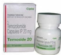
20 MG Temozolomide Capsules IP