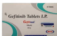
Gefitinib Tablets IP