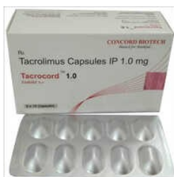
1.0 MG Tacrolimus Capsules IP