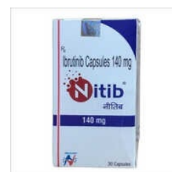
140 MG IBRUTINIB CAPSULES