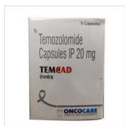
20 MG TEMOZOLOMIDE CAPSULES IP

1.0 MG Tacrolimus Capsules IP, 100 MG Erlotinib Tablets, 120 MG Denosumab Solution For Injection, 140 MG Ibrutinib Capsules, 150 MG Erlotinib Tablets IP, 20 MG Temozolomide Capsules IP, 3.75 MG Leuprolide Acetate For Injection, 300 MG Abacavir And Lamivudine Tablets IP, 300 MG Tenofovir Disoproxil Fumarate Tablets IP, 360 MG Mycophenolic Acid Delayed-Release Tablets USP, 400 MG Imatinib Tablets IP, 400 MG Sevelamer Carbonate Tablets, 400 MG Imatinib Tablets IP, 50 MG Dolutegravir Tablets, 500 MG Mycophenolate Mofetil Tablets, etc.