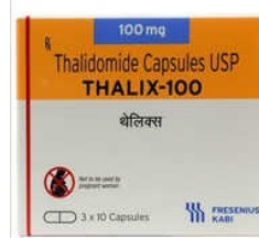
Thalidomide Capsules USP