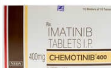
400 MG Imatinib Tablets IP 400 MG