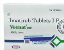
400 MG Imatinib Tablets IP