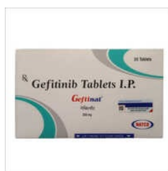
GEFITINIB TABLETS IP