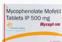
500 MG Mycophenolate Mofetil