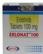
100 MG Erlotinib Tablets