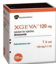
120 MG Denosumab Solution For Injection