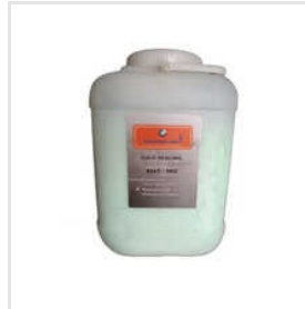
Cold Sealing Salt