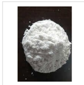
Anodise Colour Salt