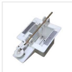
Cathode Movement Tank