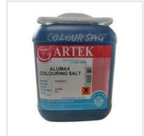
Alumax Colouring Salt Anodizing Chemical