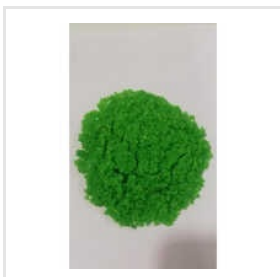
Nickel Chloride Powder