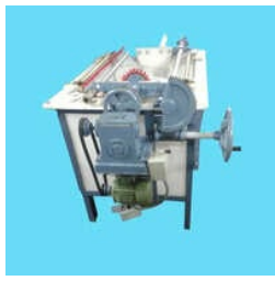
Electroplating Barrel Machine