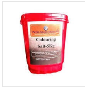
Alumax Colouring Salt