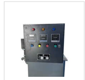
Electronic Day Gold Rectifier