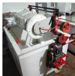
30 KG PP BEARAL