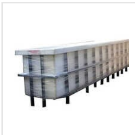
PP Tanks With Ms Steel Structure