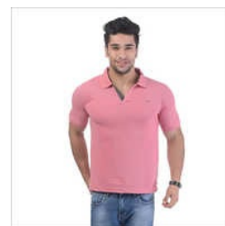
MENS REGULAR FIT DRY ROSE COLOUR COLLAR NECK SOLID T- SHIRT