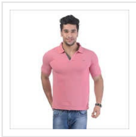
Mens Regular Fit Dry Rose Colour Collar