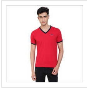
Mens Regular Fit Red Colour V-Neck Solid T-