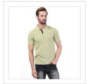
Mens Regular Fit Pista Colour Collar Neck