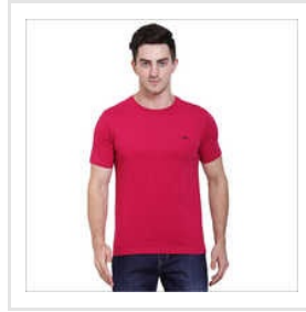
Mens Regular Fit Red Colour Round Neck