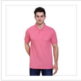
Mens Regular Fit Dry Rose Colour Polo Neck