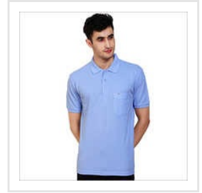
Mens Regular Fit Sky Colour Polo Neck Solid