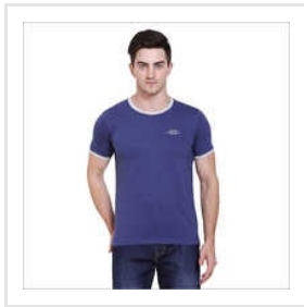
Mens Regular Fit Royal Colour Round Neck