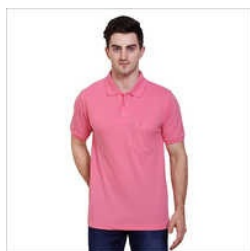
MENS REGULAR FIT DRY ROSE COLOUR POLO NECK SOLID T- SHIRT

Mens Regular Fit Denim Colour V-Neck Solid T-Shirt, Mens Regular Fit Dry Rose Colour Collar Neck Solid T-Shirt, Mens Regular Fit Dry Rose Colour Polo Neck Solid T-Shirt, Mens Regular Fit Pista Colour Collar Neck Solid T-Shirt, Mens Regular Fit Red Colour Round Neck Solid T-Shirt, Mens Regular Fit Red Colour V-Neck Solid T-Shirt, Mens Regular Fit Royal Colour Round Neck Solid T-Shirt, Mens Regular Fit Sky Colour Polo Neck Solid T-Shirt, etc.