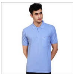
MENS REGULAR FIT SKY COLOUR POLO NECK SOLID T-SHIRT