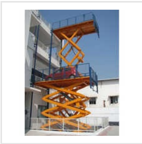
Hydraulic Car Scissor Lift