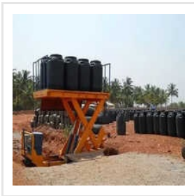
Heavy Duty Scissor Lift