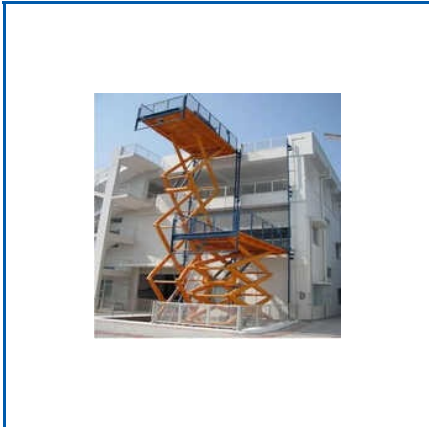
MALLS SCISSORS TYPE CAR LIFT