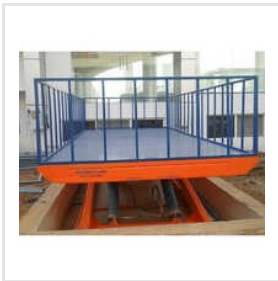
Platform Table Scissors Lift