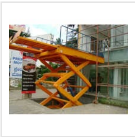
Extended Platform Car Scissor Lift