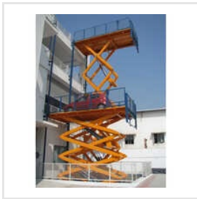
Commercial Scissors Lift