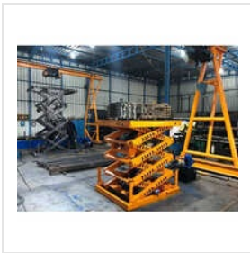
Hydraulic Platforms Scissor Lift