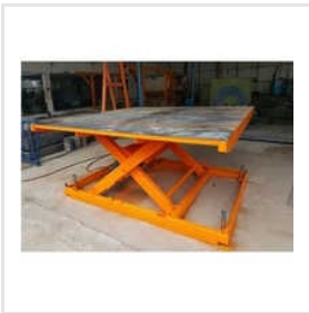
Zero Level Scissor Lift