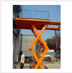
Car Parking Scissor Lift