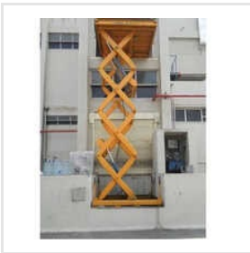
High Rise Hydraulic Scissor Lift