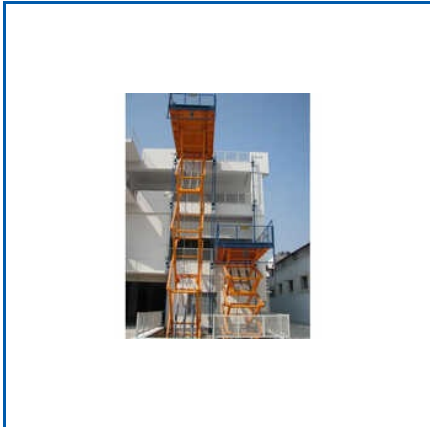
HYDRAULIC SCISSOR LIFT