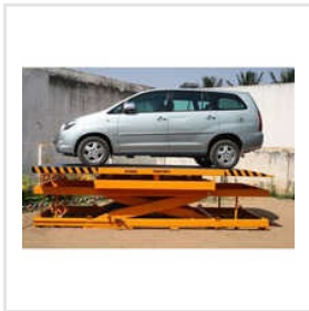
Parking Type Hydraulic Scissors Car Lift