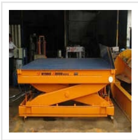
Low Rise Scissor Lift