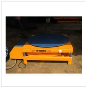
Rotating Platform Scissors Lift