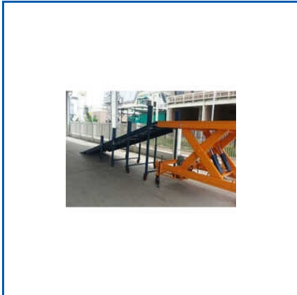
MOBILE SCISSOR LIFT

Automobile Sector Scissors Type Car Lift, Battery Pallet Stacker, Cage Goods Lift, Canteen Dumbwaiter Lift, Car Hydraulic Elevator, Car Parking Scissor Lift, Commercial Scissors Lift, Counter Balance Pallet Stacker, Double Scissors Lift, Dumbwaiter Lift, Electric Pallet Stacker, Extended Platform Car Scissor Lift, Foldable Platform Trolley, Fork Pallet Stacker, Four Wheeler Elevator, etc.