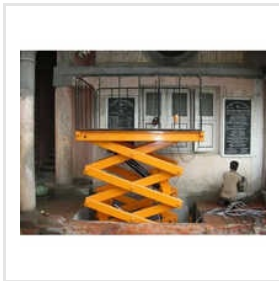
Multi Scissor Lift