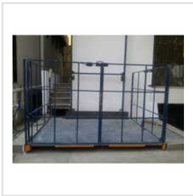
Pit Mounted Scissor Lift