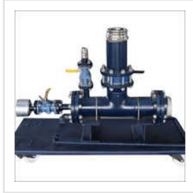
High Standard Fabrication Services