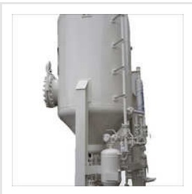
Precision Fabrication Services