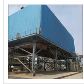
Air Cooled Condensers