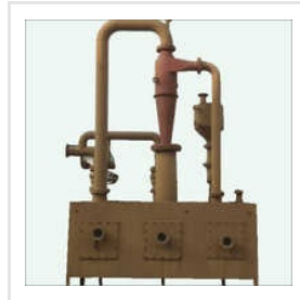
Industrial Cyclone Separator