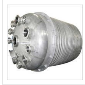
Exotic Material Fabrication Services