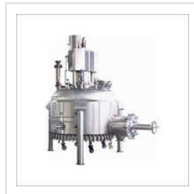
Agitated Nutsche Filter Dryer