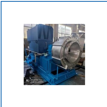
MECHANICAL VAPOUR RECOMPRESSION

Agitated Nutsche Filter Dryer, Air Cooled Condensers, Evaporation Plant, Exotic Material Fabrication Services, Functioning Equipment Fabrication Services, High Standard Fabrication Services, Hydrocyclone Filter, Industrial Cyclone Separator, Industrial Fabrication Services, Industrial SKID Mounted Units, etc.