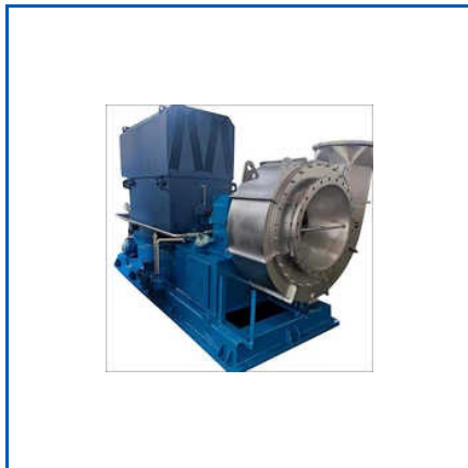
MECHANICAL VAPOR RECOMPRESSOR (MVR)