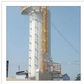
Functioning Equipment Fabrication Services