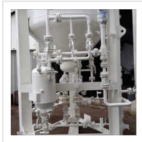
Industrial Fabrication Services