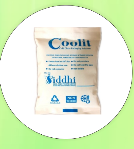
Ice Gel Cool Pack