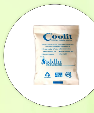
150x110 mm LDPE Pouch