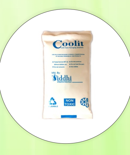
150x80 mm LDPE Pouch