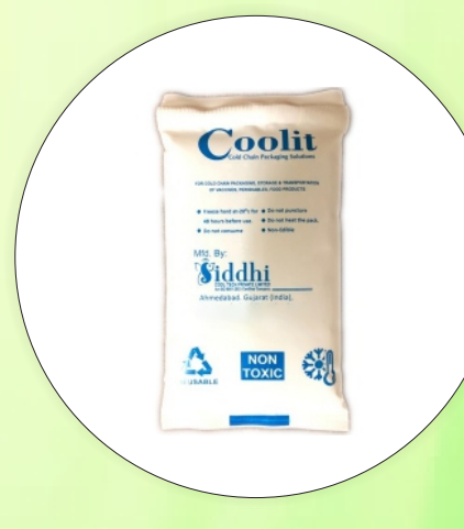
Medical Ice Pack