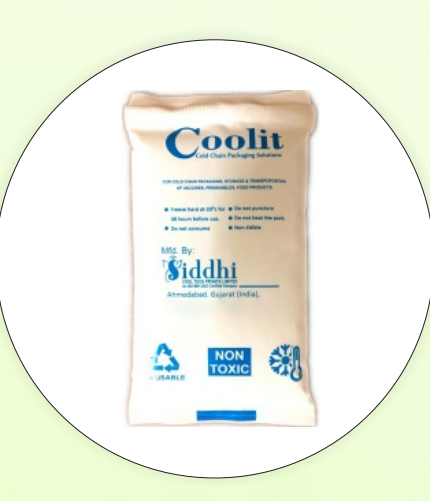
Coolit Gel Ice Pack