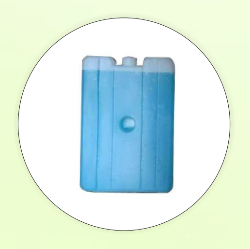
HDPE Gel Ice Pack