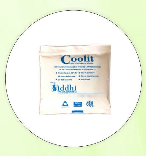
150x150 mm LDPE Pouch