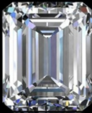
Emerald Cut Diamonds