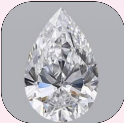
Pear Shape White Diamonds