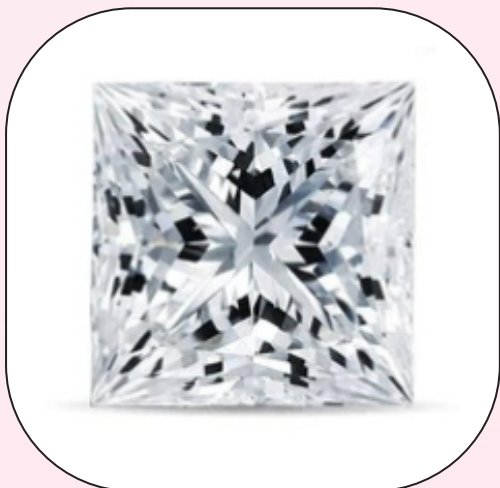
Process Cut Diamonds