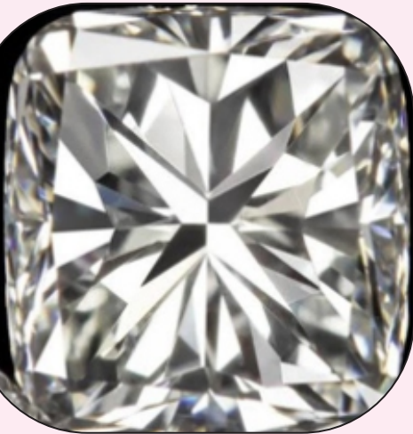
Cushion Cut Diamonds