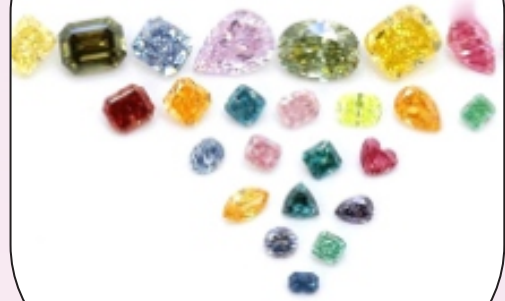
Fancy Color Diamonds