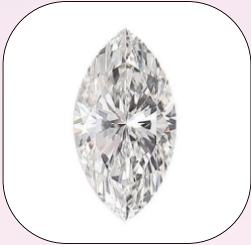
Marquise Cut Diamonds