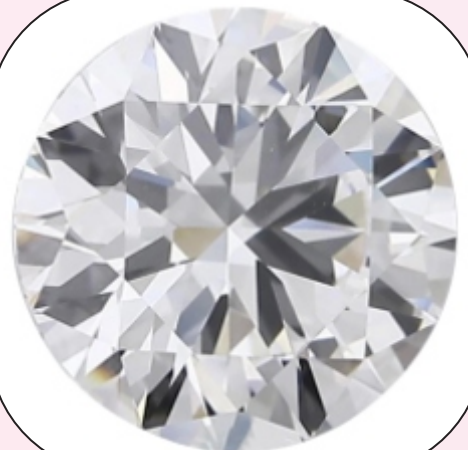
Lab Grown Diamonds