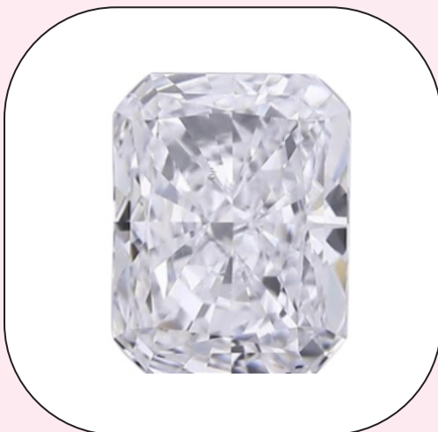
Radiant Cut Diamonds