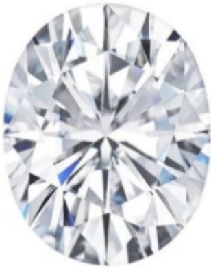
Oval Shape Diamond