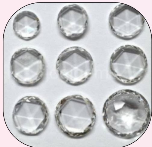
Rose Cut Diamonds