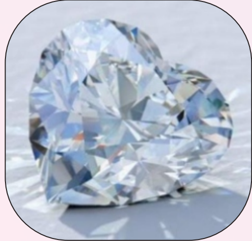
Heart Shape Diamonds