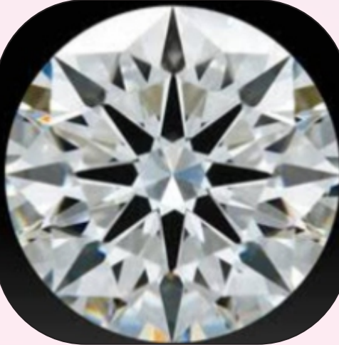
Heart And Arrow Diamonds