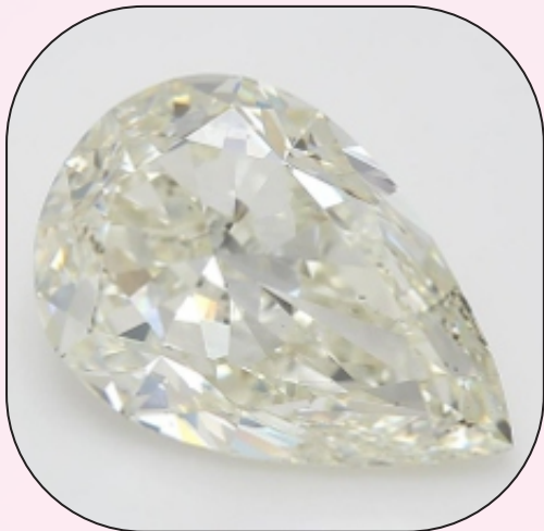
Pear Shape Diamonds