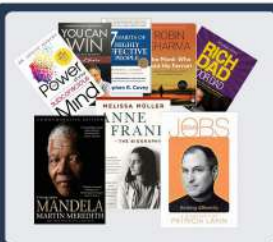
Biography & Novels