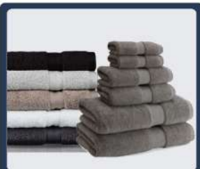
Hotel Towel sets