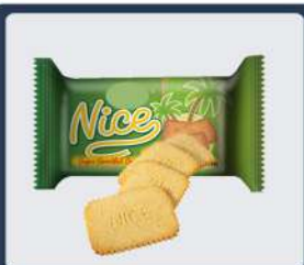
Sugar Sprinkled biscuits