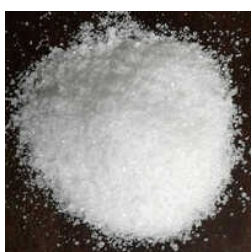
Zinc Sulphate Heptahydrate