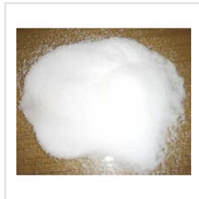
Crystal Rock Salt