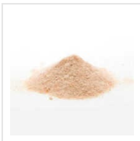
Cooking Pink Rock Salt Powder