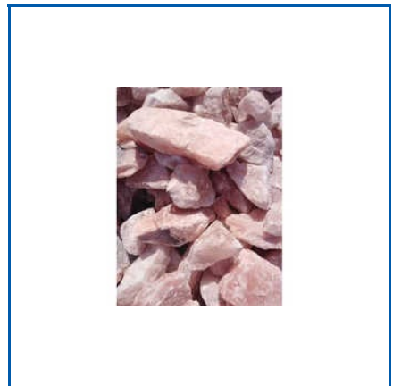
HIMALAYAN PINK ROCK SALT