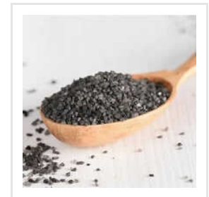
Pure Black Salt