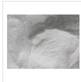
White Rock Salt Powder