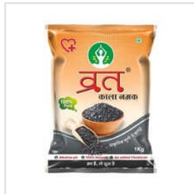
Vrat 1kg Black Salt