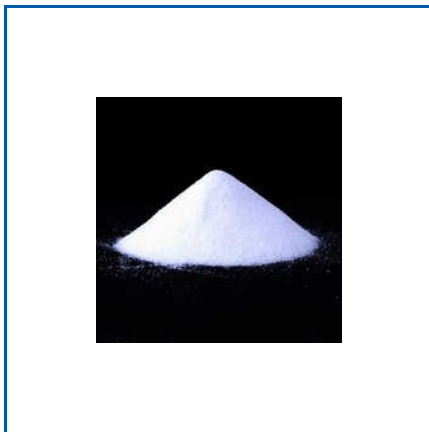
WHITE ROCK SALT

100g Rock Salt, 1kg Rock Salt, 98% Pure Rock Salt, Best Quality Himalayan Pink Salt Granules, Cooking Pink Rock Salt Powder, Crystal Rock Salt, Free Flow Rock Salt, Himalayan Orange Rock Salt, Himalayan Pink Rock Salt, Himalayan Pink Rock Salt Powder, Himalayan Pink Salt Granules, Himalayan Pink Salt Powder, Himalayan Rock Pink Salt Powder, Natural Himalayan Pink Salt Granules, Pink Salt, etc.