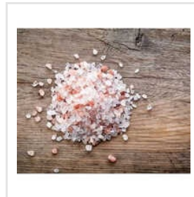
Saindhava Lavana Crystal