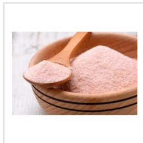
Himalayan Pink Salt Powder