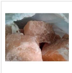
Rock Salt Lumps