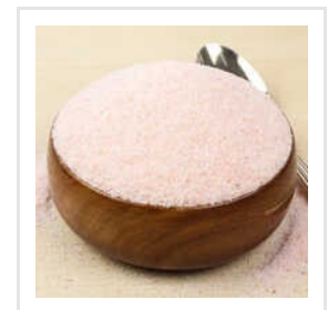
Rock Salt Powder