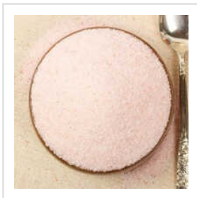
Himalayan Pink Rock Salt Powder