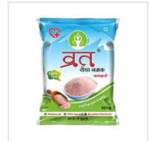
100g Rock Salt