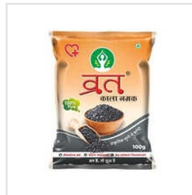
Vrat 100g Black Salt