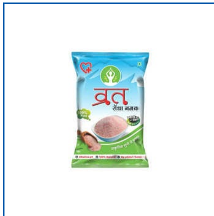
1KG ROCK SALT