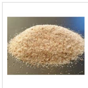
98% Pure Rock Salt