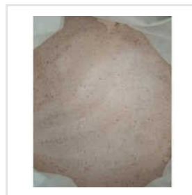
Himalayan Rock Pink Salt Powder