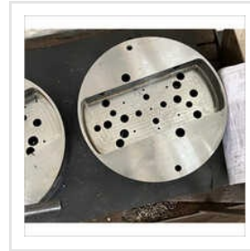
Stainless Steel Dies