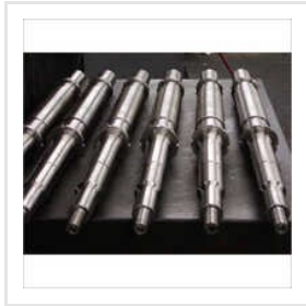
Shaft As Per Drawing