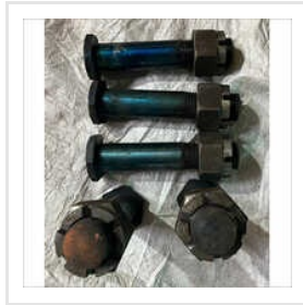
Brake Head Bolt