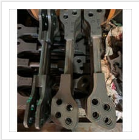
Electric Locomotives Components