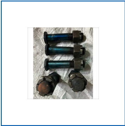
BRAKE HEAD BOLT

Adjusting Screw, Brake Head Bolt, Crane Wheel, Electric Locomotives Components, Fabricated Component, Machined Component, Shaft As Per Drawing, Stainless Steel Dies, etc.