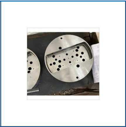
STAINLESS STEEL DIES