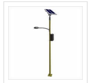
Solar LED Street Light