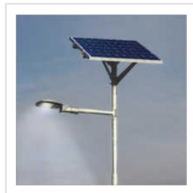
15 Watt Solar LED Street Light