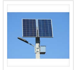
Dual Panel Solar Street Light