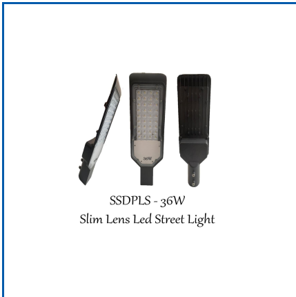
LED STREET LIGHT

15 Watt Solar LED Street Light, 30 Watt LED Solar Street Light, 40 Watt LED Solar Street Light, 70 Watt Solar Street Light, 9 Meter Mini High Mast Pole, Automatic Hand Sanitizer Dispenser, Commercial Solar Water Pumping System, Dual Panel Solar Street Light, Heat Pump Systems, High Mast Light, LED High Mast Light Pole, LED Street light, Microtek oxygen concentration, Mini Solar Home Light System, Nuetech Solar Water Heater, etc.