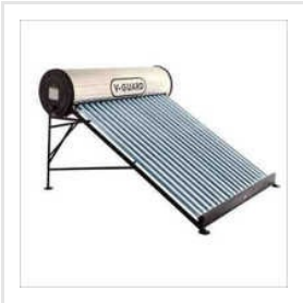
V Guard Solar Water Heater