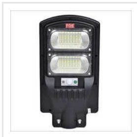
Solar LED Light