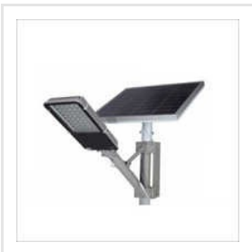
30 Watt LED Solar Street Light