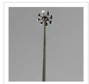
LED High Mast Light Pole