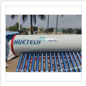
Nuetech Solar Water Heater