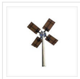
Solar High Mast Lighting Pole