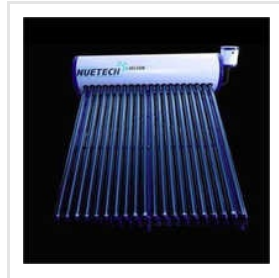
Nuetech Solar Water Heater