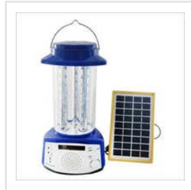
Solar LED Lantern