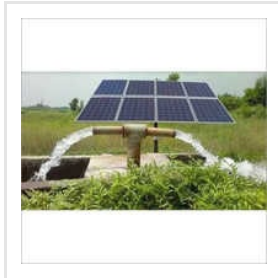
Commercial Solar Water Pumping