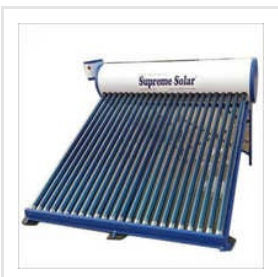
Supreme Solar Water Heater