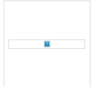
Roof Solar Water Heater