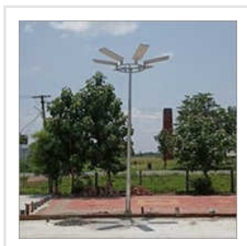
9 Meter Mini High Mast Pole