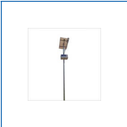
40 WATT LED SOLAR STREET LIGHT