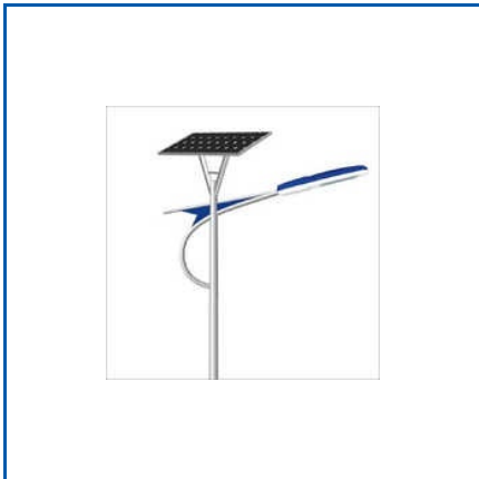
70 WATT SOLAR STREET LIGHT