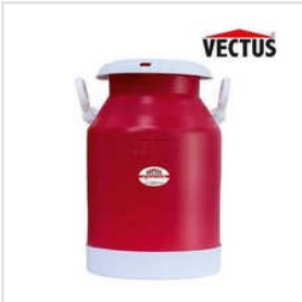
40 Litres Milk Can