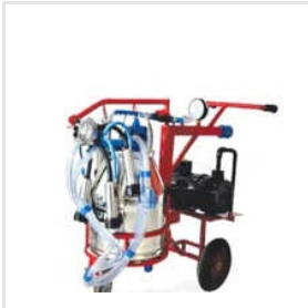
Single Bucket Milking Machine