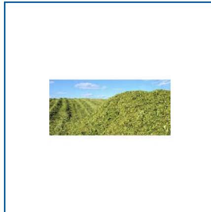
CORN SILAGE CATTLE FEED