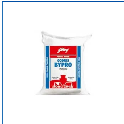
GODREJ BYPRO MAIZE CATTLE FEED