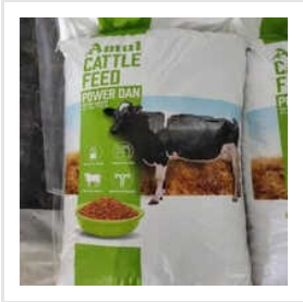
Amul Power Dan Cattle Feed