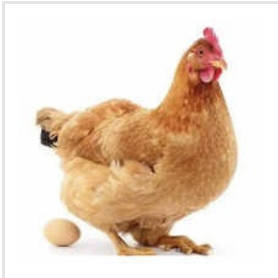
BV380 Female Chicks