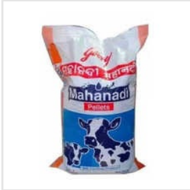
Godrej Mahanadi Pellet Cattle Feed