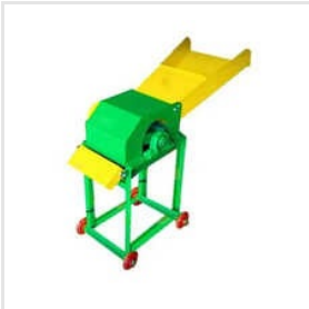
Industrial Chaff Cutter Machine