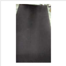
High Quality Cow Mat