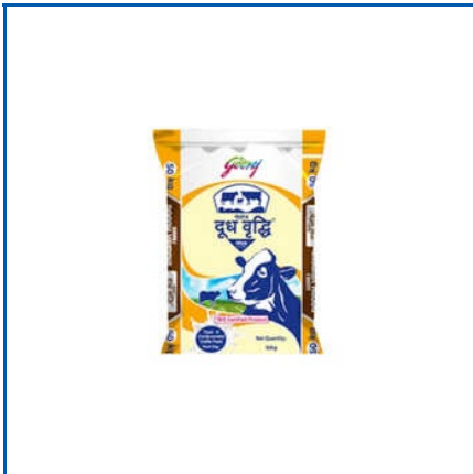
GODREJ DOODHBRADHI PELLET CATTLE FEED

1.5 HP Dairy Ventilation Fan, 40 Litres Milk Can, Amul Nutriplus Bis Type 3 Cattle Feed, Amul Power Dan Cattle Feed, BV380 Female Chicks, Cattle Drinking Water Bowl, Corn Silage Cattle Feed, Cow Calf Cage, Cow Dung Trolley, Cow Mohri Leash, Dairy Farming And Processing Consultancy Services, Double Bucket Milking Machine, Fresh Brown Eggs, Godrej Bypro Maize Cattle Feed, Godrej Doodhbradhi Pellet Cattle Feed, etc.