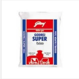
Godrej Super 50 Kg Cattle Feed