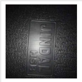
Jindal HSR Cow Mat