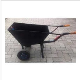
Cow Dung Trolley