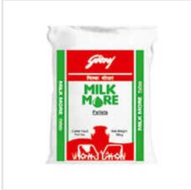
Godrej Milk More Pellet Cattle Feed