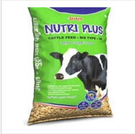
Amul Nutriplus Bis Type 3 Cattle Feed