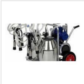
Double Bucket Milking Machine