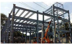
Mezzanine Floor Structure