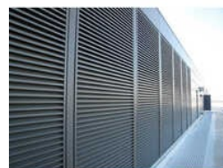
Industrial Aluminum Louvers