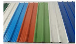
Trapezoidal Profile Sheet