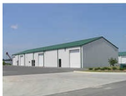
Pre Fabricated Steel Structure