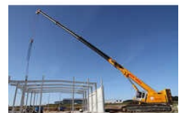
Turnkey Contractors For PEB Structures