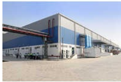
Industrial Warehouse Shed