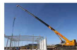
TURNKEY CONTRACTORS FOR PEB STRUCTURES