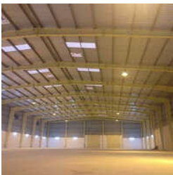
Turnkey Contractors For Peb