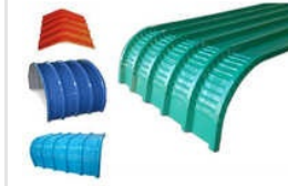
Roof Crimping Sheets