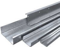
Metal Z And C Purlin