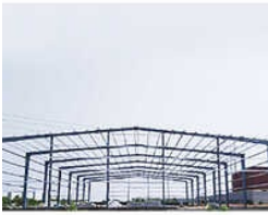
Pre Engineered Building System