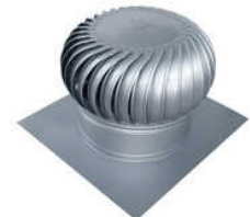
Turbo Air Ventilator