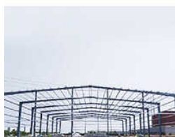
PRE ENGINEERED BUILDING SYSTEM

Industrial Aluminum Louvers, Industrial Pre Engineered Building Systems, Industrial Warehouse Shed, Metal Z And C Purlin, Metaldeck Sheet, Mezzanine Floor Structure, Pre Engineered Building System, Pre Fabricated Steel Structure, Puf Panels And Rock Wool Panels, Roof Crimping Sheets, Sandwich Puf And Rock Wool Panels, Steel Mezzanine Floor Structures, Trapezoidal Profile Sheet, Turbo Air Ventilator, Turnkey Contractors For PEB Structures, etc.