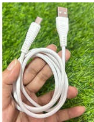
1 Amp LD Mold Charging Cable