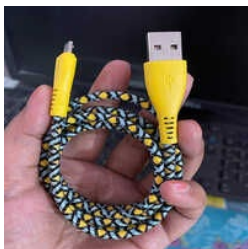
2.4 Amp Data Cable Colour Braided Wire