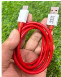
65W 4 Core Vooc Charging Cable