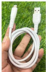
2 Amp iPhone Charging Cable