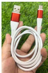
C TYPE DATA CHARGING CABLE WITH METAL CAP