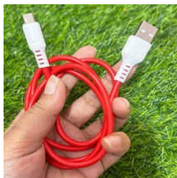
2 AMP DOUBLE COLOUR CHARGING CABLE

1 Amp LD Mold Charging Cable, 1.5 Amp Type C Charging Cable, 1.5 Amp V8 Data Cable, 2 Amp Data Cable With Metal Cap Design Braided Wire, 2 Amp Double Colour Charging Cable, 2 Amp Metal Cap C Type Charging Cable, 2 Amp Slim Mold Data Cable, 2 Amp iPhone Charging Cable, 2.1mm DC Charging Cable, 2.4 Amp Data Cable Colour Braided Wire Design With Colour Molding, 2.4 Amp Data Cable With Metal Cap Braided Wire, etc.