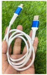
1.5 Amp V8 Data Cable