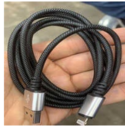
2.5 Amp iPhone Metal Cap Jeera Design Data