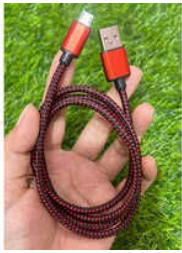
2.4 Amp Data Cable With Metal Cap