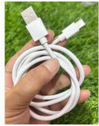
1.5 Amp Type C Charging Cable