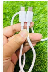
USB C To Type C 25W PD Charging Cable