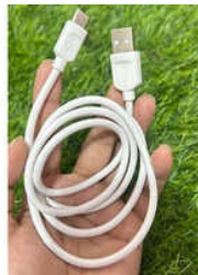
C Type Charging Cable