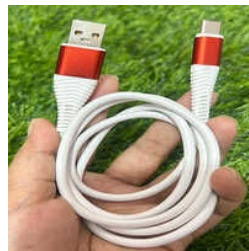
2.4 Amp Data Cable With Metal Cap Design