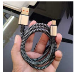
2Amp Data Cable With Metal Cap Design