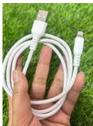
2.4 Amp iPhone Data Cable