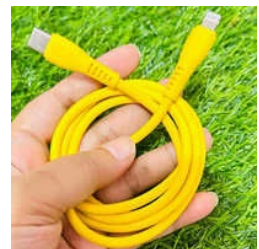
USB C To iPhone PD 5 Core Charging Cable