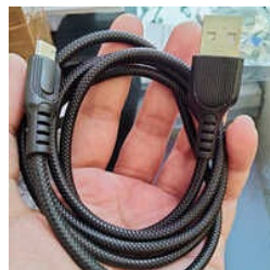
2Amp C Type Double Mold PVC Charging