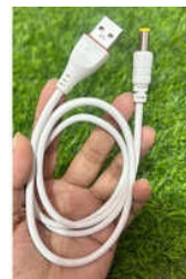
2.1MM DC CHARGING CABLE