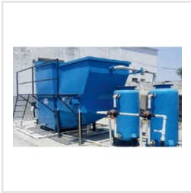
Effluent Treatment Plant