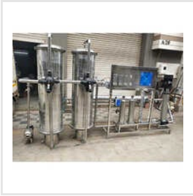
Stainless Steel RO Plant