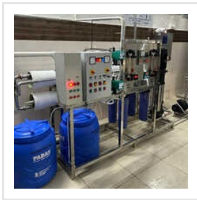
RO Plant 6000 LPH