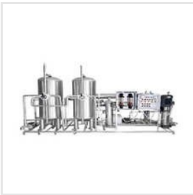
RO Plant 4000 LPH