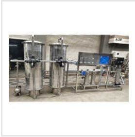
RO Plant 1000 LPH