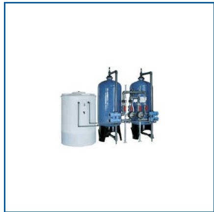
WATER SOFTENER PLANT 5000 LPH