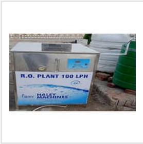
RO Plant 100 LPH