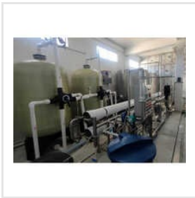
RO Plant For Mineral Water