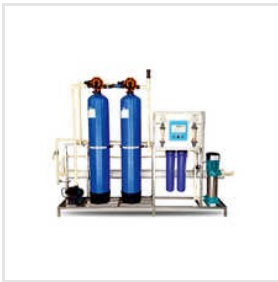
Industrial RO Plant