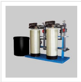
Water Softener Plant 1000 LPH