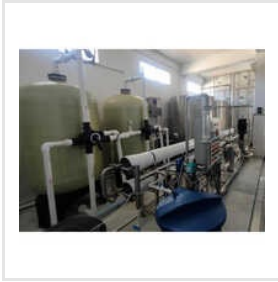
RO Plant 20000 LPH