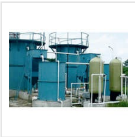
Industrial ETP Plant