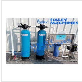
RO Plant 250 LPH