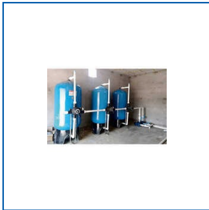
INDUSTRIAL WATER SOFTENER PLANT