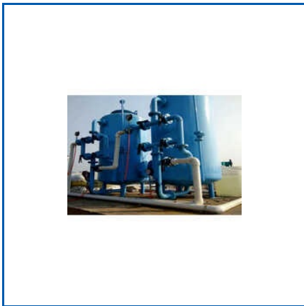
WATER SOFTENER PLANT 10000 LPH

Air Cooled Chiller, CETP Plant, DM Plant, EA STP Plant, Effluent Treatment Plant, Industrial ETP Plant, Industrial RO Plant, Industrial STP Plant, Industrial Water Softener Plant, Juice Plant, MBBR STP Plant, Mineral Water Bottling Plant, Portable ETP Plant, Pre Fabricated STP Plant, RO Plant 100 LPH, etc.