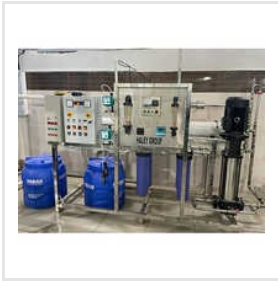
RO Plant 10000 LPH