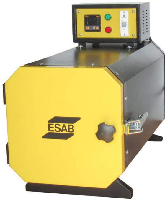
Electrode Bench Oven 25 kgs

ESAB's new 25 kg Electrode re-drying Bench Ovens provide uniform heating through multiple heating elements placed strategically around a cylindrical inner chamber. Thick insulation and a strong door locking mechanism ensures no loss of heat from body and the door.