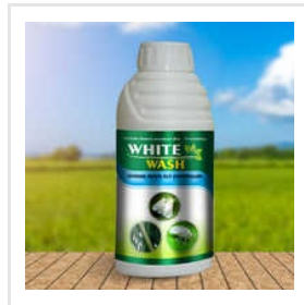
Strong White Fly Controller Pesticides