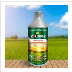
Agriculture Sucking Pesticide