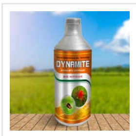
Strong Controller Bio Miticide