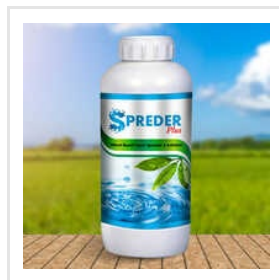
Silicon Based Super Spreader And