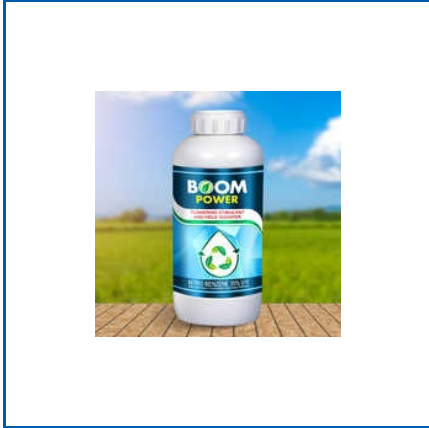
FLOWERING STIMULANT AND YIELD BOOSTER

98 Super Potassium F Humate Shiny Flakes 98% Humic Acid Flakes, Agriculture Sucking Pesticide, BLACK DIAMOND_ 98% Super Potassium Humic Shiny Flakes, Bio Fungicide, Bio Larvicide, Bio Stimulant, Flowering Stimulant And Yield Booster, Humic Acid, Humic Acid 15% or Amino Acid 10% Plant Growth Promoter, Silicon Based Super Spreader And Activator, Strong Controller Bio Miticide, Strong White Fly Controller Pesticides, etc.