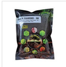
98 Super Potassium F Humate Shiny Flakes