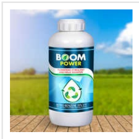
Flowering Stimulant And Yield Booster