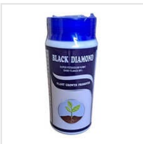
BLACK DIAMOND_98% Super Potassium