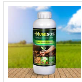
Humic Acid 15% Or Amino Acid 10% Plant