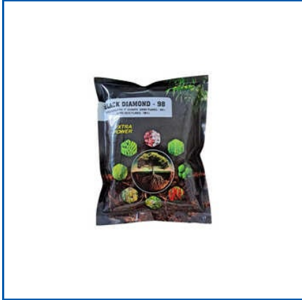
98 SUPER POTASSIUM F HUMATE SHINY FLAKES 98% HUMIC ACID FLAKES