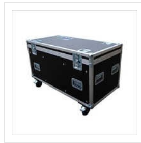
Flight Case Accessories