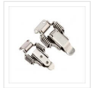
Spring Toggle Latch