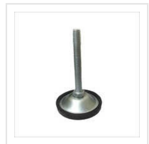
Metal Levelling Pad