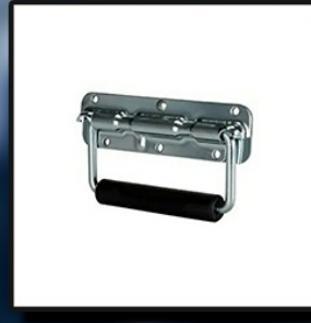
MS SPRING CHEST HANDLE