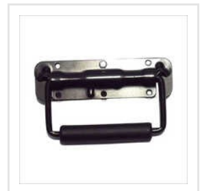
Spring Chest Handles Black