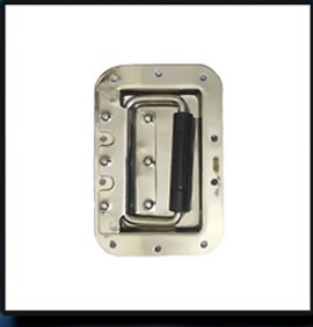
SS PLATE SPRING CHEST HANDLE