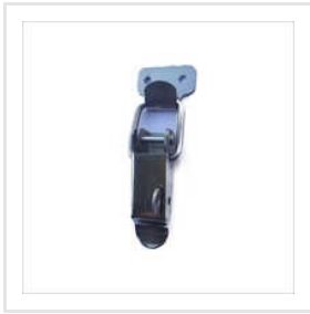
SS Toggle Latch With Lock