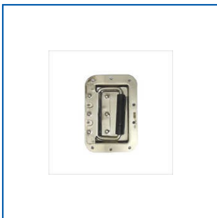
SS PLATE SPRING CHEST HANDLE

5 inch SS Chest Handle, Flight Case Accessories, Furniture Level Adjuster, Heavy Duty Spring Chest Handle, Heavy Metal Leveling Pad, Leveling Pad With Grouting, MS Spring Chest Handle, Metal Levelling Pad, Polyamide Leveling Pad, Polyamide Levelling Pad, SS Leg Leveler, SS Plate Spring Chest Handle, SS Spring Chest Handle, SS Toggle Latch, SS Toggle Latch With Lock, etc.