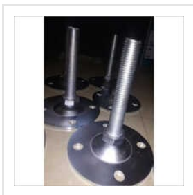
Heavy Metal Leveling Pad