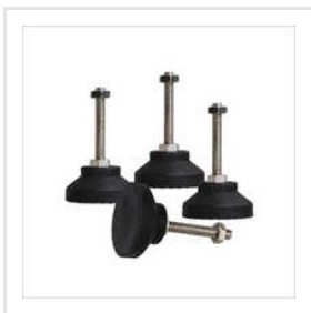
Furniture Level Adjuster