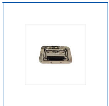
SPRING PLATE CHEST HANDLE