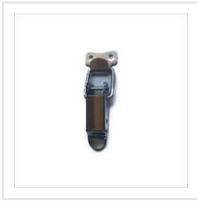
SS Toggle Latch