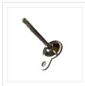
Leveling Pad With Grouting