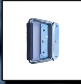
DRAWER SPRING CHEST HANDLE