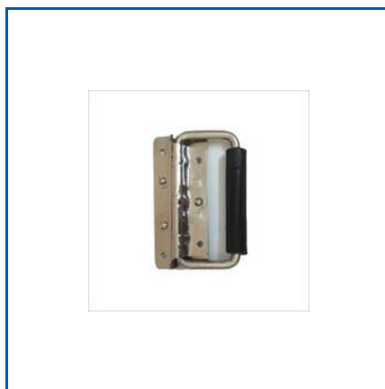
SS SPRING CHEST HANDLE