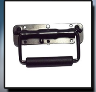
SPRING CHEST HANDLES BLACK

5 inch SS Chest Handle, Flight Case Accessories, Furniture Level Adjuster, Heavy Duty Spring Chest Handle, Heavy Metal Leveling Pad, Leveling Pad With Grouting, MS Spring Chest Handle, Metal Levelling Pad, Polyamide Leveling Pad, Polyamide Levelling Pad, SS Leg Leveler, SS Plate Spring Chest Handle, SS Spring Chest Handle, SS Toggle Latch, SS Toggle Latch With Lock, etc.