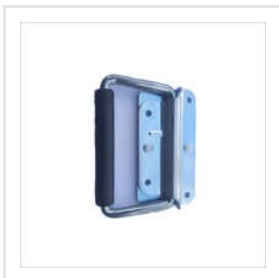
Heavy Duty Spring Chest Handle