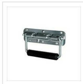
MS Spring Chest Handle