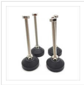
Polyamide Levelling Pad