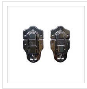
Suitcase Toggle Latch