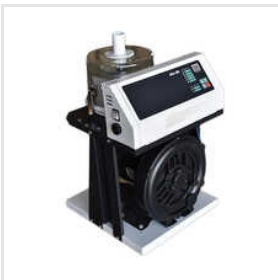
Industrial Granule Auto Loader