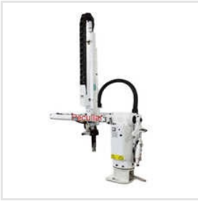
Sprue Picker Swing Arm Robot