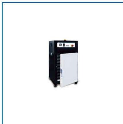
SHINI ELECTRIC CABINET DRYER