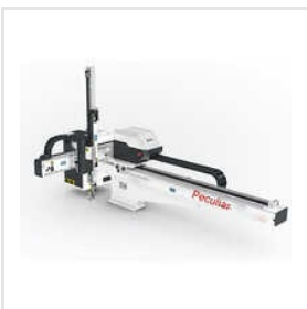
Three Axis Robotic Arm