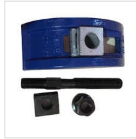
C Type Mold Clamp