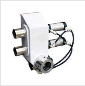
Industrial Proportional Valve