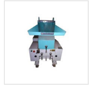
Plastic Granules Cutting Machine