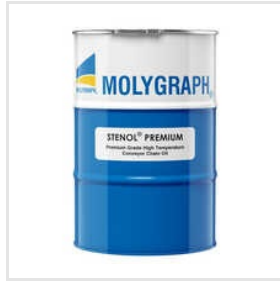
Safol High Temperature Chain Oil