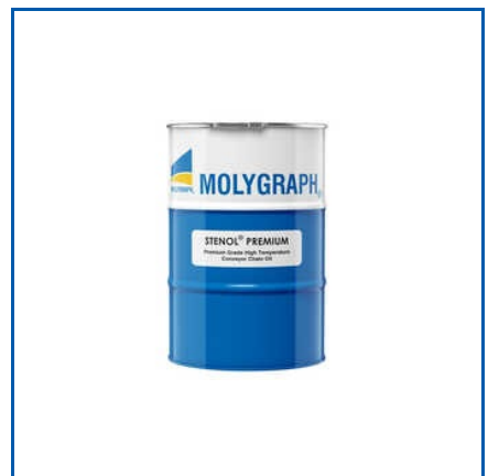
SAFOL HIGH TEMPERATURE CHAIN OIL