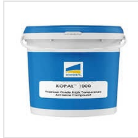
Kopal Copper Base Grease Antiseize