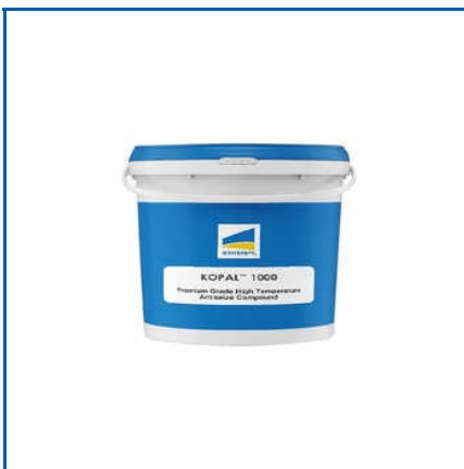
KOPAL COPPER BASE GREASE ANTISEIZE COMPOUND

C Type Mold Clamp, Industrial Granule Auto Loader, Industrial Hopper Dryer, Industrial Proportional Valve, Kopal Copper Base Grease Antiseize Compound, Material Storage Mixer, Metal Separator For Plastic Granules, PVC Low Speed Granulator, Plastic Granules Cutting Machine, Safol High Temperature Chain Oil, Safol-220 Food Grade Chain Oil, Shini Electric Cabinet Dryer, Sprue Picker Swing Arm Robot, Stainless Steel Hopper Magnet, Three Axis Robotic Arm, etc.