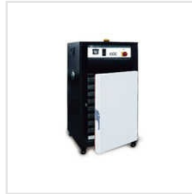
Shini Electric Cabinet Dryer