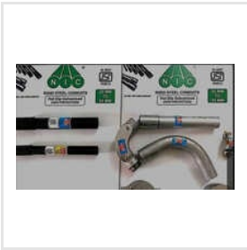
Nic Ms Conduit Pipe