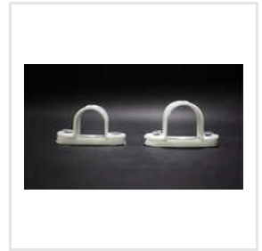
PVC Conduit Pipe Base Saddle