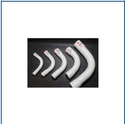
PVC CONDUIT PIPE BEND