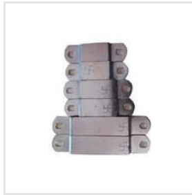
GI Saddle Clamp