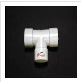
Heavy PVC Conduit Pipe Tee