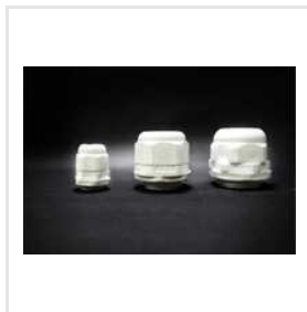
PVC Cable Gland