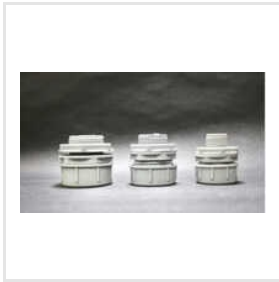
Steel Reinforce Flexible Pipe PVC Coupler