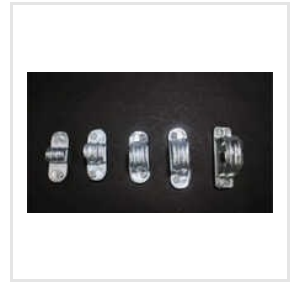
MS Conduit Pipe Base Saddle