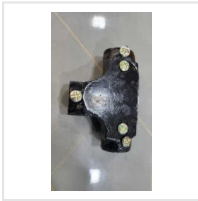
Ms Inspection Tee