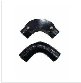
MS Inspection Bend