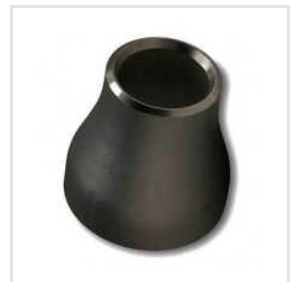
MS Conduit Pipe Reducer