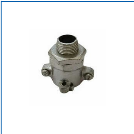
GI FLEXIBLE PIPE COUPLER