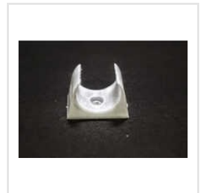
PVC Conduit Pipe Catcher