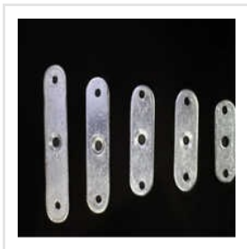
GI Conduit Pipe Saddle