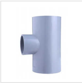
PVC Pipe Socket