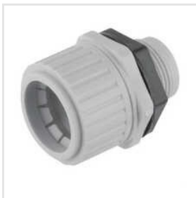
PVC Pipe Coupling