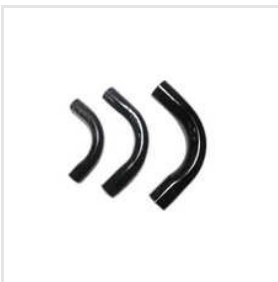
MS Conduit Pipe Bend