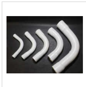
Pvc Pipe Bend