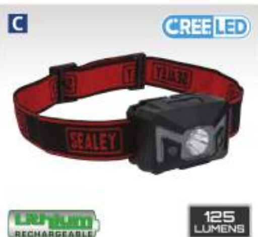
C 3W CREE XPE LED Rechargeable Head Torch with Auto-Sensor Model No. HT102R

Hands-free head torch with adjustable 3W CREE XPE LED spotlight to direct light as required. One switch features an auto-sensor to activate light with the wave of a hand and standard on/off switch. Produces up to 125 lumens. Other switch has four options - full, 50% energy saving mode, flash and red light. Powered by a rechargeable 3.7V 1.2Ah Li-ion battery. Supplied with micro USB charging lead.