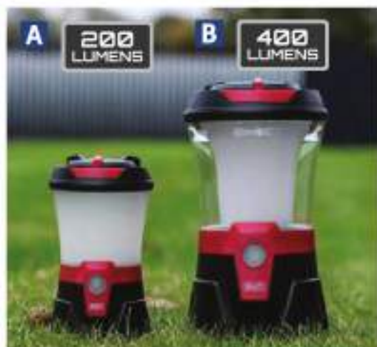
A - B SMD LED Lanterns Model No. SEE BELOW

Composite case lanterns with hanging/carry handle. Produces warm white light and features two or three selectable light settings, depending on model.