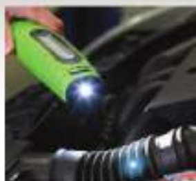
3W LED directional torch.