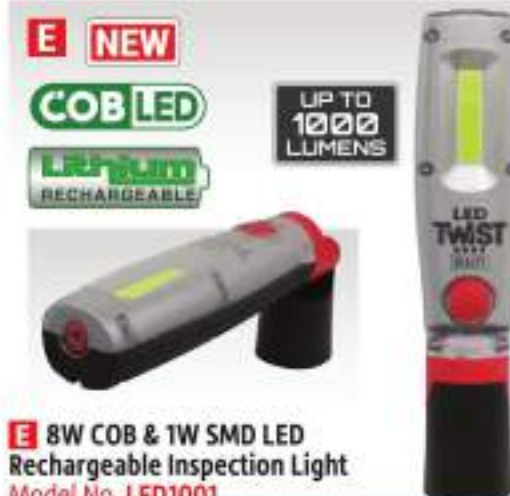
E 8W COB & 1W SMD LED Rechargeable Inspection Light Model No. LED1001

E 1W LED directional torch. Hanging hook on reverse. 1000 lumens, 8W COB LED. On/Off button incorporates (High/Low)/Top: (2/4)/16hr. 90° Flex with additional 360° twist function. Rubber covered magnet on base.