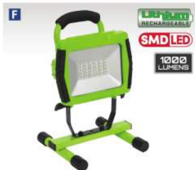
F 30 SMD LED Rechargeable Portable Floodlight Model No. LED109C

Portable floodlight with adjustable head, housed within a stable steel frame. Features 30 super bright SMD LEDs, giving a full 120° spread of light. Weatherproof design with an on/off rocker switch and two light settings. Built-in 7.4V 4Ah Lithium-ion rechargeable battery. Supplied with a 3-pin UK plug, mains charger and 12V in-car charger. Suitable for lighting workshops, garages and other environments where no mains supply is available.