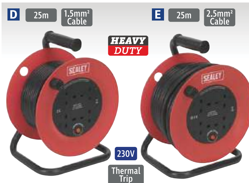
D - E 25m Heavy-Duty Cable Reels with Thermal Trip 4 x 230V Model No. SEE BELOW