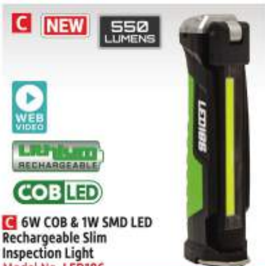
C 6W COB & 1W SMD LED Rechargeable Slim Inspection Light Model No. LED186

Slimline foldout inspection lamp for use in confined spaces with its slim 9mm thickness. Inspection arm can be rotated 180° and folded. Features 1 COB LED, which produces up to 550 lumens and a 1W SMD LED on the end for use as a directional torch. Main light has two different lighting modes High/Low (550lm/220lm) and the SMD spotlight which has one setting at 80lm. Suitable for hands-free operation with a magnet and a hanging hook. Folds away, small and compact, suitable for keeping in your pocket. Powered by a 3.7V 2Ah rechargeable Lithium-ion battery, which lasts up to 8 hours. Supplied with USB charging lead.