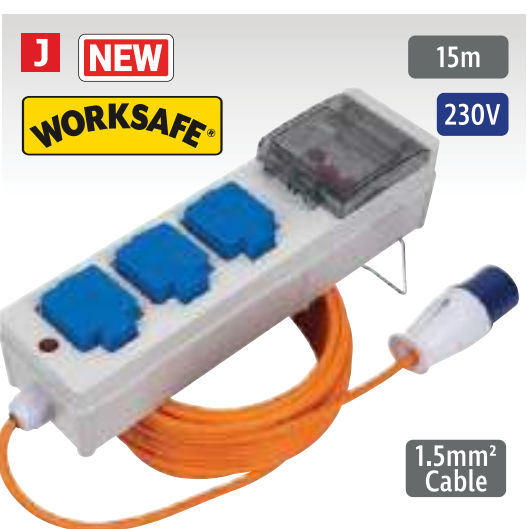
J 15m Caravan & Camping Mains Unit with RCD Model No. WSC16133

Caravan and camping mains unit fitted with three UK standard 230V~50Hz 13A sockets and a 2P+E Plug rated at 230V~50Hz 16A. Fitted with a residual current circuit breaker 25A 2-pole and a mini circuit breaker 16A 2-pole. IP44 Rated.