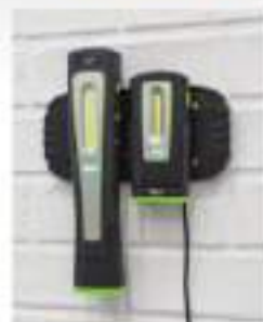
D 5V-2A Double Wireless Charging Base Model No. WCB2

Double wireless charging base fitted with two strong magnets for attaching to a metal surface. Four holes at each corner for permanent fixture to non-metallic surface or wall. Charges both Model No's LEDWC01 and LEDWC02 Wireless Rechargeable Inspection Lamps. Supplied with USB charging cable and 5V-2A charging adaptor.