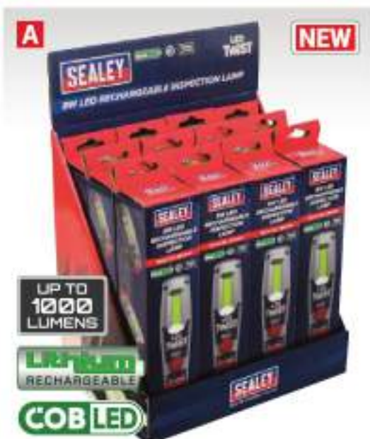
A 8W LED Rechargeable Inspection Light Display Box of 12 Model No. LED1001DB

Smooth 90° flex with additional 360° twist function enables the light source to be positioned in any direction. Super bright COB LED provides up to 1000 lumens output with 120° spread of light, illuminating the whole work area. Includes an additional high power 1W LED directional torch. Features a swivel hanging hook and rubber covered magnet on the base, which allow hands-free operation. Two high quality 2.6Ah Lithium-ion batteries for longer life, no memory effect and a much slower discharge than traditional Ni-MH batteries. Type-C USB charging port. Supplied with Type-C USB cable.