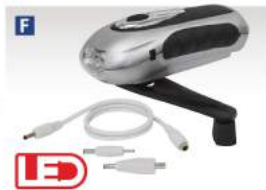
F 3 LED Wind-Up Rechargeable Torch Model No. AK3305

Bright LED light available under all conditions with 30 minutes illumination from 1 minute's winding. Ideal for outdoor activities and as an emergency torch in the home or car. Includes a charging outlet port with adaptors to micro USB capable of charging mobile phones. Two switchable levels of brightness. No batteries or bulbs to replace.