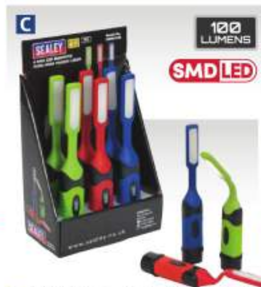
C 6 SMD LED Magnetic Flexi-Head Pocket Light - Display Box of 6 Model No. LED051DB

Flexible head bends and holds position to allow bright illumination in confined spaces. Two brightness settings of 100 or 70 lumens. Features a magnet in the end for hands-free use. Display box of six.