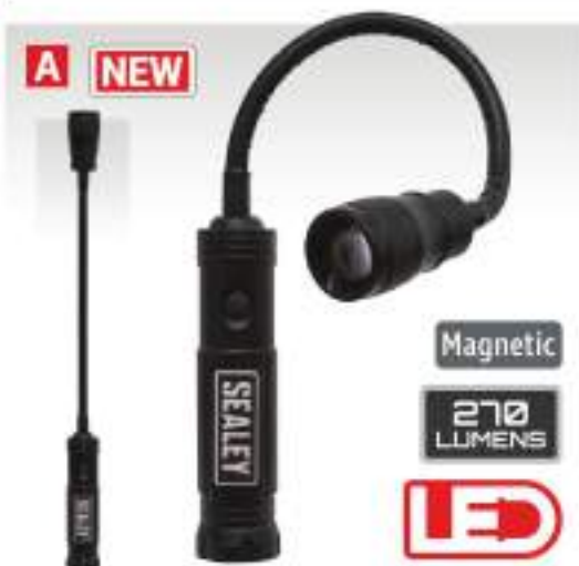
A 270lm Osram P8 LED Aluminium Magnetic Flexi-Head Light Model No. LED021

Osram P8 LED produces 270 lumens. Flexible head bends and holds position to allow bright illumination in confined spaces. Adjustable focus from spotlight to wide area by a push/pull action of the head. Features a magnet in the end for hands-free use.