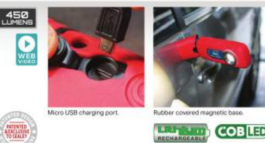
Micro USB charging port.