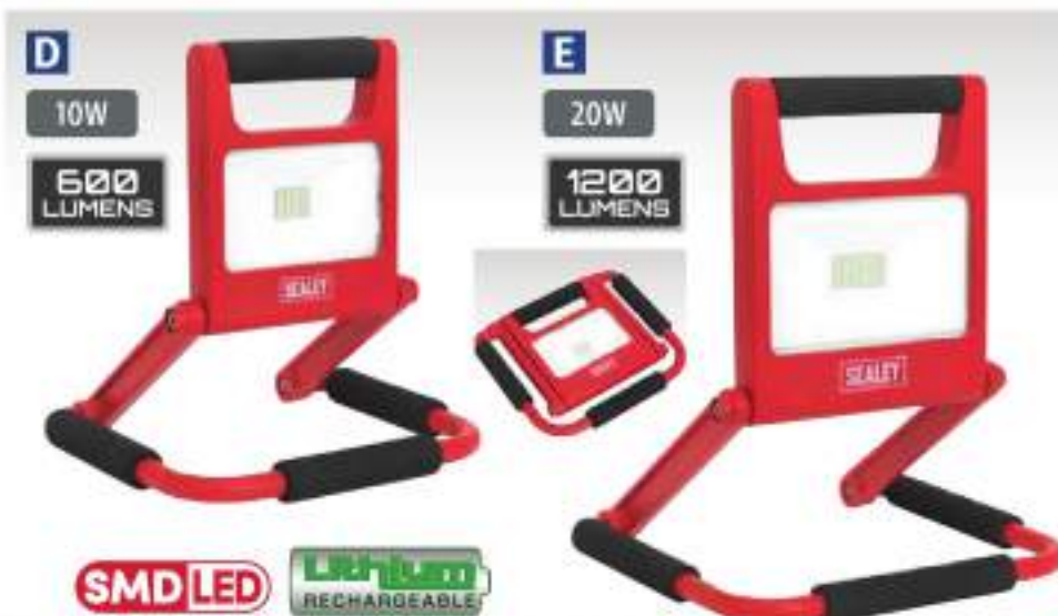
D - E SMD LED Rechargeable Portable Floodlights - Fold Flat Model No. SEE BELOW

Innovative swivel function enables floodlights to rotate 360° and fold flat. Floodlight houses super bright SMD LEDs with 110° spread of light. High quality Lithium-ion battery for longer life and a much slower discharge than traditional NI-MH batteries. Supplied with mains charger.