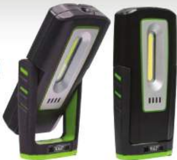
A 3W COB & 1W SMD LED Inspection Light Wireless Rechargeable Model No. LEDWC01

Heavy-duty inspection lamp with dimming function. Supplied with one strong magnet on the base and two on the back. Lumen output on side lamp 30-300lm with dimming function and 100lm on top light. Operating time 2-10hr on side lamp and 5.5hr on the top light. Charging time is 2.5hr. Includes LED indicator for level of charge on the front of the torch. Charger not included, compatible with Model No's WCB1 and WCB2 Wireless Charging Bases.