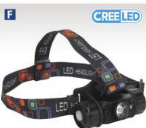
F 5W CREE XPG LED Rechargeable Head Torch with Auto-Sensor Model No. HT108LED

Hands-free head torch with adjustable 5W CREE XPG LED spotlight to direct light as required. Features auto-sensor to activate light with the wave of a hand and standard on/off switch. Two power options of full and a 30% energy saving mode. Powered by rechargeable 3.7V 2Ah Li-ion battery. Supplied with micro USB charging lead.