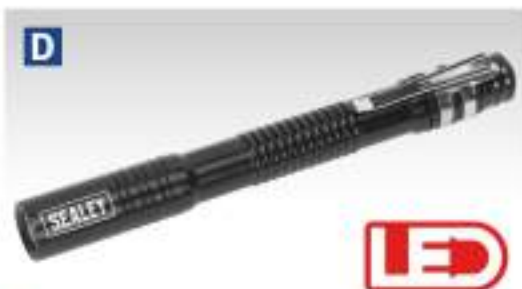
D 0.5W LED Aluminium Penlight Model No. LED043

Powerful, precise and pocket-sized penlight. 0.5W LED gives extremely bright light with up to 50 lumen output. On/off fingertip switch.