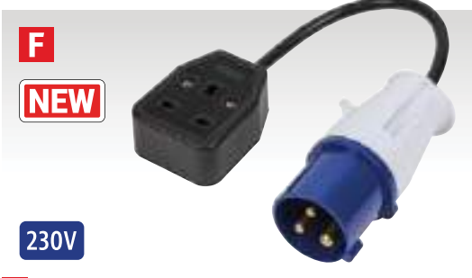
F 16A/13A Trailing Socket & Cable Set Model No. WPS16131

Trailing socket and cable fitted with a 230V~50Hz 13A standard UK socket and 2P+E plug rated at 230V~50Hz 16A. H05VV-F 3G 1.5mm Section cable, 350mm in length. IP20 Rated.