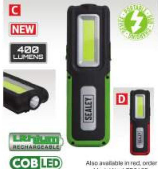
C-D 5W COB & 3W SMD LED Rechargeable Inspection Lights With Power Bank Model No. SEE BELOW

Lightweight lamps. Featuring a super bright 5W COB LED light source, which gives an even and constant spread of light, producing up to 400 lumens. 3W High power LED torch producing up to 100 lumens. Integral hanging hook/belt clip with magnets and a magnetic base which can rotate through 180° for hands-free applications. Features a battery level indicator. Rechargeable 3.7V 2Ah Li-ion battery for longer life, no memory effect and a much slower discharge than traditional Ni-MH batteries. Built-in emergency power bank to charge mobile devices. Micro USB charging port. Supplied with USB cable.