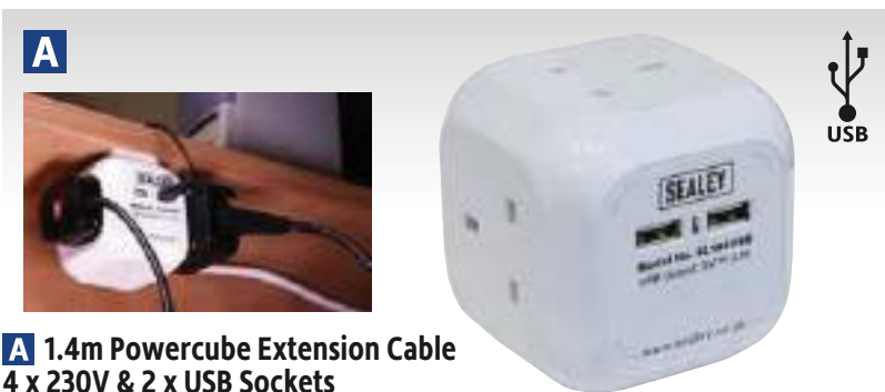
A 1.4m Powercube Extension Cable 4 x 230V & 2 x USB Sockets Model No. EL144USB

Space-saving cube design. Suitable for garage, workshop and office applications. Features 2 x 5V (2.1A) USB sockets and 4 x 230V sockets. Fitted with 3-pin heavy-duty plug. Supplied with bracket, suitable for mounting under desks (covers one socket).