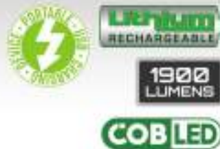
A 20W COB LED Rechargeable Portable Floodlight & Power Bank Model No. LED184

Die-cast aluminium housing with integral 180° adjustable stand. COB LED technology allows ultra-bright illumination. Power switch has three brightness settings (low, medium and high) producing up to 1900 lumens. Features battery level indicator and a 5V-1A USB output for charging electronic devices. Supplied with USB charging lead.