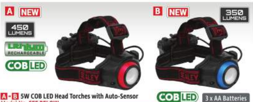
A - B 5W COB LED Head Torches with Auto-Sensor Model No. SEE BELOW

Hands-free 5W COB LED with 40° angle-adjustment. Dimmer switch allows brightness to be adjusted from 20% to 100%. Main light has one switch with four functions, on, flash, auto-sensor and off. Hold down switch to enable auto-sensor function which will allow turning on/off just by waving hand in front. Rear of strap includes a red LED warning light which has two functions, flash or on, ideal for a cycling light. Adjustable headband and foam brow for added comfort. Model No. HT111R is powered by rechargeable 3.7V 2.2Ah Li-ion battery and includes a battery charging level indicator and a micro USB charging lead. Model No. HT111LED is powered by 3 x AA batteries (not included).