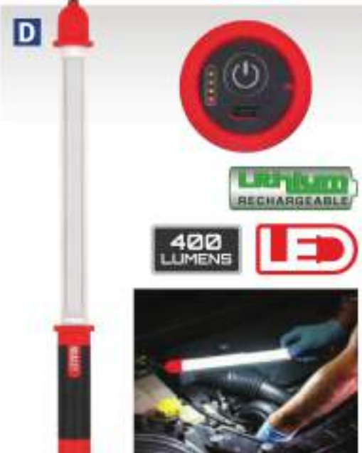
D 6W LED Rechargeable Light Model No. LED176

Composite construction, rechargeable inspection lamp. High output with even spread of light up to 400 lumens. Features 50% or 100% lighting modes, 360° hanging hook, battery level indicator and micro USB charging port. Supplied with micro USB charging lead.