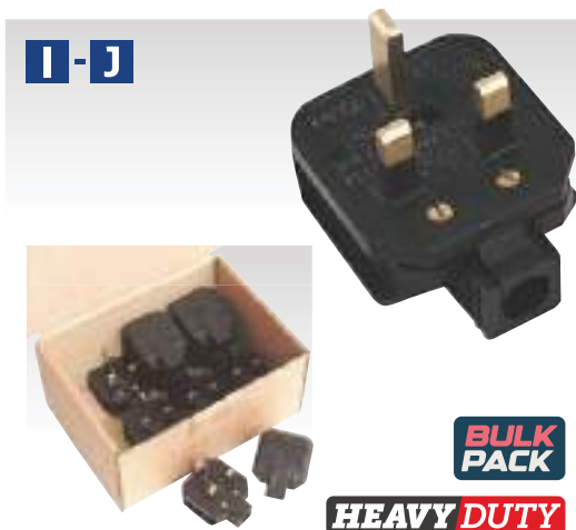
I-J 13A Heavy-Duty Plug Model No. SEE BELOW