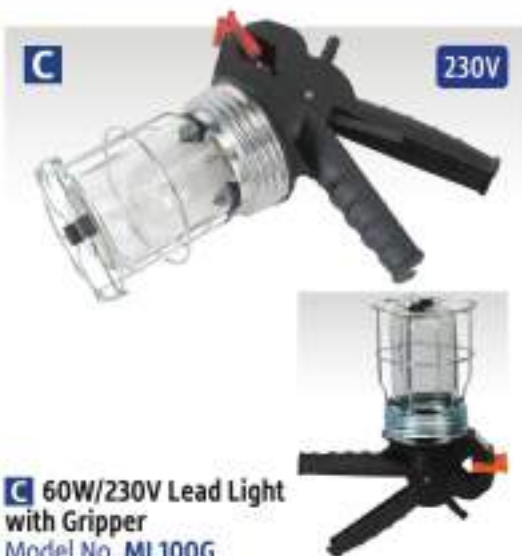
C 60W/230V Lead Light with Gripper Model No. ML100G

Tough composite construction, features unique spring loaded mechanism incorporated into handle. Two red rubber covered pads help prevent accidental damage to gripped surfaces. Bulb mounted in ceramic holder and protected by metal grille giving safe, directional light. Supplied with 5m cable.