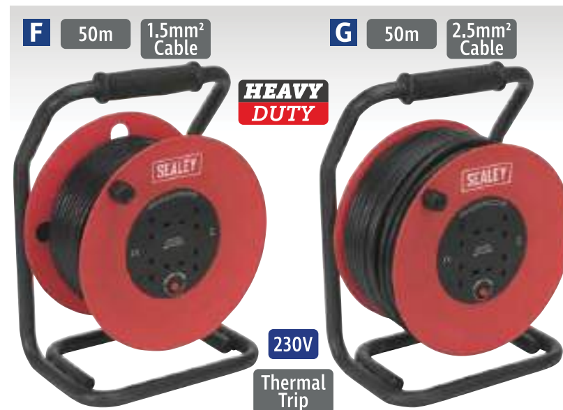
F - G 50m Heavy-Duty Cable Reels with Thermal Trip 4 x 230V Model No. SEE BELOW