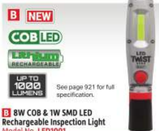
B 8W COB & 1W SMD LED Rechargeable Inspection Light Model No. LED1001

Smooth 90° flex with additional 360° twist function enables the light source to be positioned in any direction. Super bright COB LED provides up to 1000 lumens output with 120° spread of light, illuminating the whole work area. Includes an additional high power 1W LED directional torch. Features a swivel hanging hook and rubber covered magnet on the base, which allow hands-free operation. Two high quality 2.6Ah Lithium-ion batteries for longer life, no memory effect and a much slower discharge than traditional Ni-MH batteries. Type C charging port. Supplied with Type C USB cable.