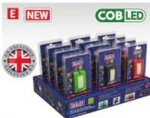
E 2W COB LED Rechargeable Head Torch with Auto-Sensor - Display Box of 12 Model No. LED360HTDB

Display box includes 4 x Green, 4 x Red and 4 x Black models. New design 360° multi-function COB LED rechargeable head torch. Headband can also be used as a wristband. Band can be removed giving you a work light with a clip which can be clipped to many objects like a baseball cap. Will also stand by itself sturdy as a table light. One button includes five different lighting options. First press is 100% white light, second dims to 40% white light, third is red warning light (1W COB LED) and fourth is red warning flash, which makes it ideal for cycling. Holding the button enables auto-sensor function to switch on/off just by waving hand in front. Adjustable head/wristband and foam brow for added comfort. Powered by 3.7V 0.5Ah Li-Poly battery. Supplied with micro USB charging cable.