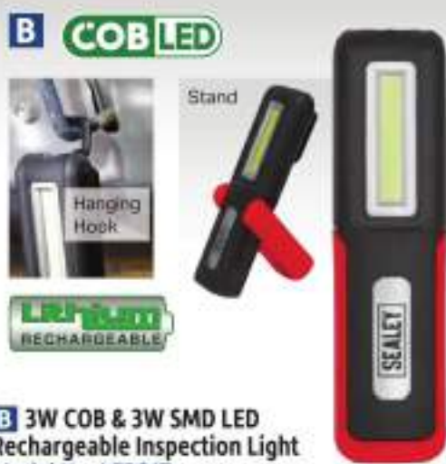
B 3W COB & 3W SMD LED Rechargeable Inspection Light Model No. LED317

Mini, lightweight lamp. Featuring a super bright 3W COB LED light source, which gives an even and constant spread of light, producing up to 250 lumens. 3W High power LED torch producing up to 100 lumens. Integral hanging hook/belt clip and a magnetic base which can rotate through 180° for hands-free applications. Features a battery level indicator. Rechargeable 3.7V 1.2Ah Li-ion battery for longer life, no memory effect and a much slower discharge than traditional Ni-MH batteries. Micro USB charging port. Supplied with micro USB cable.