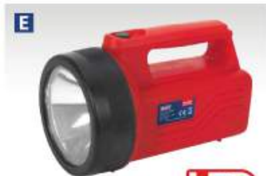
E 0.5W LED Spotlight Model No. AK427

Spotlight with strong composite case with sealed switch and a long lasting, energy efficient LED bulb.