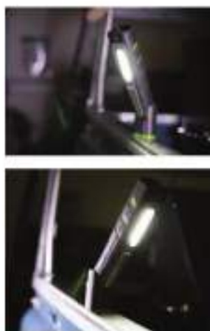
B 5W COB & 3W SMD LED Inspection Light Wireless Rechargeable Model No. LEDWC02

Heavy-duty inspection lamp with dimming function. Supplied with one strong magnet on the base and two on the back. Lumen output on side lamp 50-500lm with dimming function and 300lm on top light. Operating time is 3-10hr on side lamp and 5hr on the top light. Charging time is 5hr. Includes LED indicator for level of charge on the front of the torch. Charger not included, compatible with Model No's WCB1 and WCB2 Wireless Charging Bases.