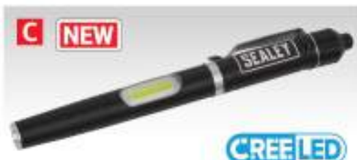
C 3W CREE XTE & 1W COB LED Aluminium Penlight Model No. LED016

Powerful, precise and pocket-sized penlight. 1W COB gives extremely bright light with up to 50 lumen output. CREE XTE side light with up to 55 lumen output. On/off fingertip switch.