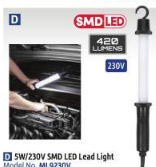
D 5W/230V SMD LED Lead Light Model No. ML9230V

High output illumination with even spread of light. SMD LEDs lower power consumption, saving on energy costs, and have a high shock resistance and life span. Supplied with 5m cable.