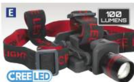
E 3W CREE XPE LED Head & Hat Torch Model No. HT103LED

3W CREE XPE LED with adjustable inclination to direct light as required. Features optical zoom for dissipating the spread of light. Removable light with clip-on hat function. Adjustable headband and foam brow pad for added comfort. Push-button on/off switch.