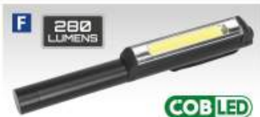
F 3W COB LED Penlight Torch Model No. LED125

Professional aluminium design, features pocket/belt clip with integrated magnet for hands-free operation. Produces up to 280 lumens. Ideal for use in the workshop, garage and home.