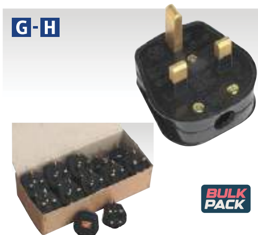
G-H 13A Plug Model No. SEE BELOW