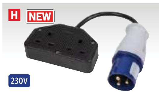
H 16A/13A Trailing Twin Socket & Cable Set Model No. WPS16132

Trailing twin socket and cable fitted with 230V~50Hz 13A standard UK sockets and 2P+E plug rated at 230V~50Hz 16A. H05VV-F 3G 1.5mm Section cable, 350mm in length. IP20 Rated.