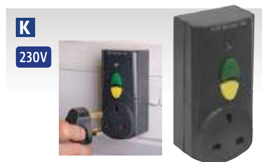
K RCD Safety Adaptor 230V Model No. RCD981

Cuts power automatically to protect against electrocution. Suitable for all types of indoor and outdoor electrical appliances. Easy-to-use, 2-button operation. No wiring needed - plugs straight into 13A socket. No need to remove from socket to reset unit.