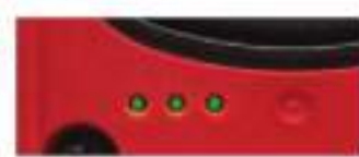
Battery life indicator.