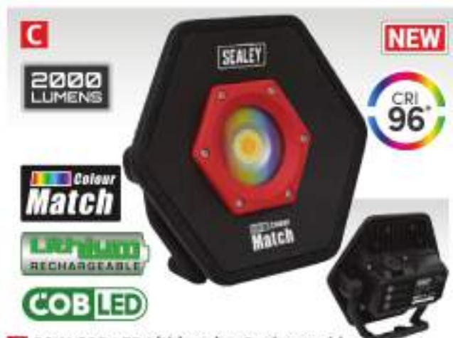
C 20W COB LED Lithium-ion Rechargeable Floodlight - Colour Matching CRI 96 Model No. LED068

Rechargeable professional floodlight with super bright COB LED which gives an even and constant spread of light. Five colour temperature options, 2700K, 3500K, 4500K, 5500K and 6500K. Produces a light with a CRI (Colour Rendering Index) of 96, which gives a daylight effect. Ideal for detecting swirls and differences in paint colour when touching up areas of bodywork. Three settings allow for 25, 50 or 100% brightness to suit task. Features a 180° adjustable stand and a five LED battery level indicator. Supplied with quick release charging lead.