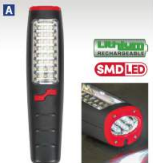
A 24 SMD & 7 LED Rechargeable Inspection Light Model No. LED307

Heavy-duty housing features 24 super bright SMDs. Seven LEDs in the end for use as a directional torch. 360° Hanging hook and a magnet on rear of lamp for hands-free applications. 3.7V Lithium-ion 1.5Ah battery. Single LED battery indicator. Supplied with 12V in-car charger and mains charger.