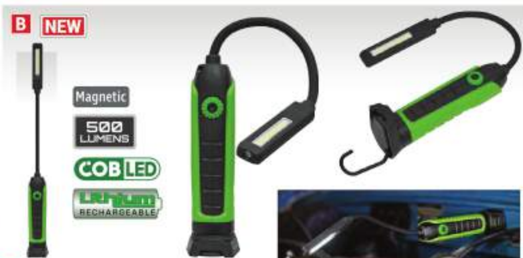
B 5W COB & 1 SMD LED Flexi Rechargeable Inspection Light Model No. LEDFLEXG

Unique new 360° design made from high-impact materials. High power COB LED produces up to 500 lumens in tight spaces like engine compartments. Features a 160mm strong heavy-duty flexible neck with the ability to hold its position wherever you need it. Top light is a 3W LED producing up to 120 lumens. Features a sturdy base which means it can also be used as a desk lamp. Base includes a strong magnet and 90° folding hook. One switch controls top light, side light and dimmer function. Features LED battery charge level indicator and charges via a USB Type-C lead. (Supplied with USB Type-C Cable).