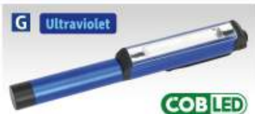
G 3W Ultraviolet COB LED Penlight Torch Model No. LED125UV

Professional aluminium design, features pocket/belt clip with integrated magnet for hands-free operation. Produces an ultra violet light for fault finding with fluorescent dyes used in leak detection. Ideal for use in workshops or garages.