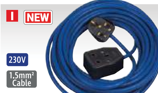
I 14m Extension Lead 230V 13A Model No. EL15240

Extension cable fitted with 230V~50Hz 13A plug and socket. Conforms to BS EN 60309.