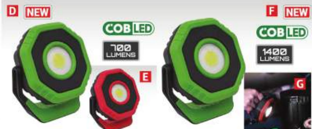
D-G 360° COB LED Rechargeable Pocket Floodlights with Magnet Model No. SEE BELOW

Incredibly tough aluminium housing with sturdy handle which can rotate through 360°. Virtually indestructible and one of the most durable floodlights available. Also fitted with a strong magnet, making it simple and easy to direct light. Three light output settings. Features three LED battery level indicator. Fitted with a high quality 3.7V Lithium-ion battery. Charges via USB Type-C lead (USB Type-C Cable included).