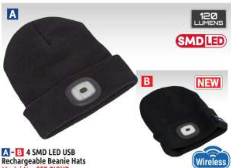
A - B 4 SMD LED USB Rechargeable Beanie Hats Model No. SEE RIGHT

Warm and comfortable beanie hats with a removable SMD spotlight. Features three light settings - full light (100%) medium light (75%) and low light (50%). Positioning of the LED gives a sufficient beam of light ahead of the user. Removable lamp is chargeable via a USB port. Powered by a rechargeable 3.7V 300mAh Lithium-Polymer battery. Model No. LED185W includes wireless headphones for phone calls and music 2.4GHz transfer speed up to 10m.