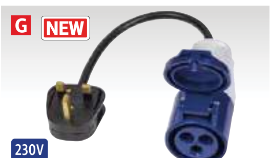
G 13A/16A Trailing Socket & Cable Set Model No. WSP1316

Trailing socket and cable fitted with a 230V~50Hz 13A standard UK plug and 2P+E socket rated at 230V~50Hz 16A. H05VV-F 3G 1.5mm Section cable, 350mm in length. IP20 Rated.