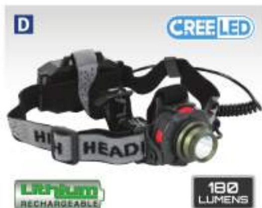
D 3W CREE XPE LED Rechargeable Head Torch with Auto-Sensor Model No. HT106LED

Hands-free 3W CREE XPE LED spotlight with adjustable inclination to direct light as required. Features auto-sensor to switch on/off just by waving hand in front. Alternatively can be overridden to stay on/off by push-button. Two brightness settings. Adjustable headband and foam brow for added comfort. Powered by rechargeable 3.7V 1.5Ah Li-Poly battery. Supplied with micro USB charging lead.