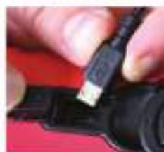
LED battery life indicator. Micro USB charger port.