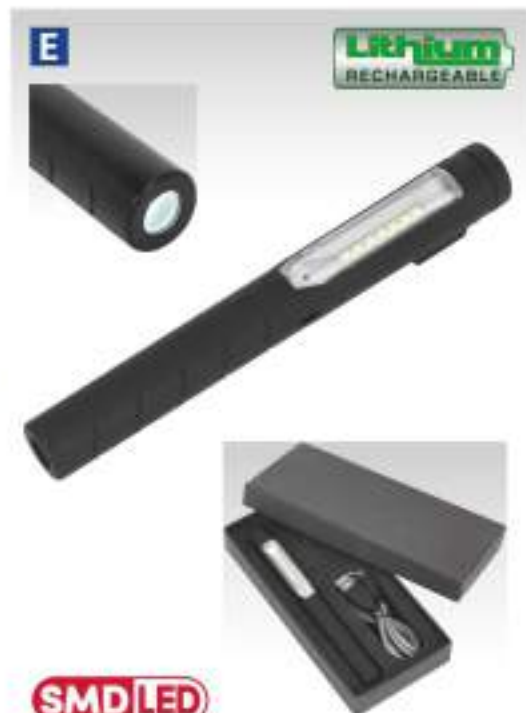
E 7 SMD & 1W LED Rechargeable Inspection Penlight Model No. LED047

Seven SMD LED inspection lamp coupled with a bright 1W LED directional torch. USB rechargeable Lithium-Ion battery with charging indicator, suffers no memory effect so performs better for longer. A strong magnet in the pocket/belt clip allows for hands-free use. Supplied in a presentation box with a USB lead.