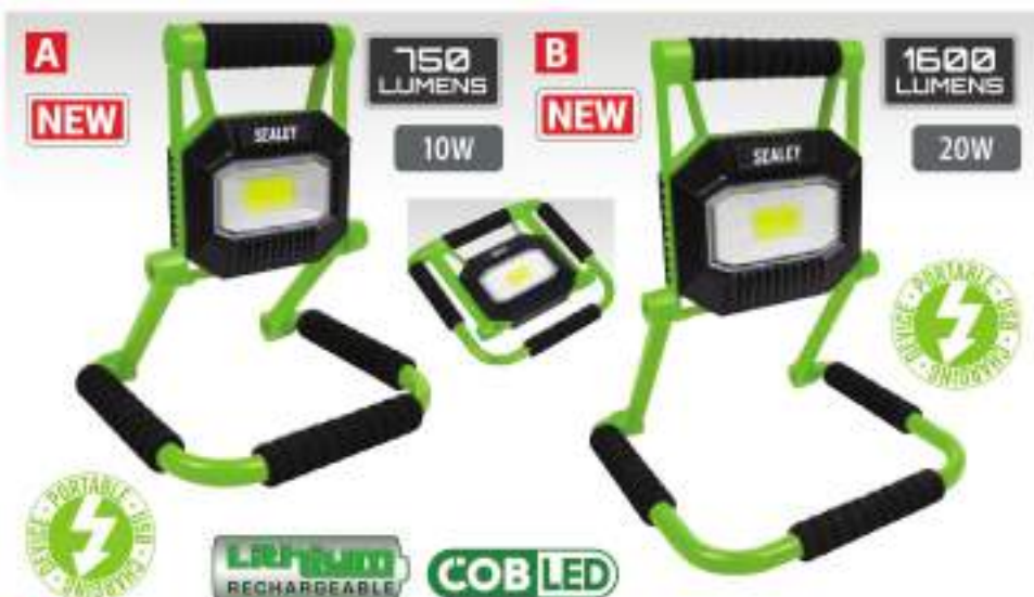
A - B COB LED Rechargeable Portable Floodlights - Fold Flat Model No. SEE BELOW

COB LED work lights. Two brightness settings plus SOS and flash modes. Durable folding frame makes for easy storage. Micro USB input and USB output both 5V 1A with power indicator light. Supplied with 1m micro USB charging cable.