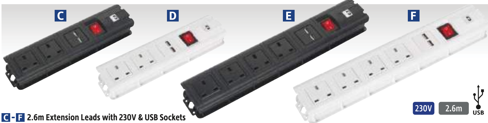
C-F 2.6m Extension Leads with 230V & USB Sockets Model No. SEE BELOW

Suitable for garage, workshop and office applications. Features 2 x 5V (2.4A) USB sockets and 230V sockets (quantity dependent on model) and an on/off rocker switch. Fitted with 3-pin heavy-duty plug.