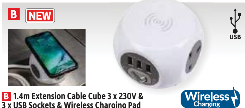
B NEW 1.4m Extension Cable Cube 3 x 230V & 3 x USB Sockets & Wireless Charging Pad Model No. EL144WC

Space-saving cube design. Suitable for garage, workshop and office applications. Features 3 x 5V (2.4A) USB sockets and 3 x 230V sockets. Fitted with 3-pin heavy-duty plug. Includes wireless charging pad (5W) suitable for any wireless charging enabled devices.