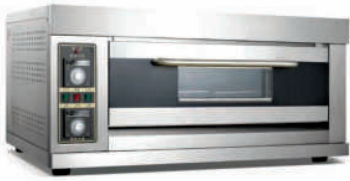
Single Deck Oven