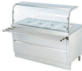
Hot Bain Marie With Sneeze Guard