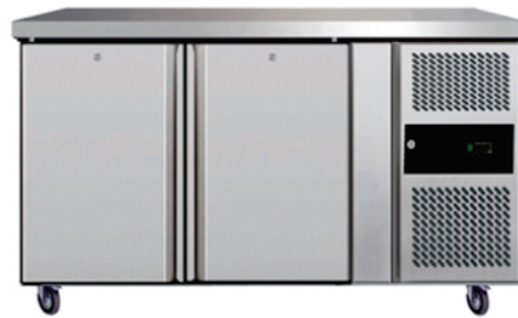
Under Counter Refrigerator