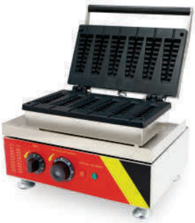
Stick Waffle Machine