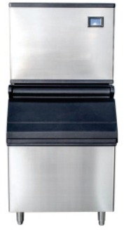
Ice Cube Machine