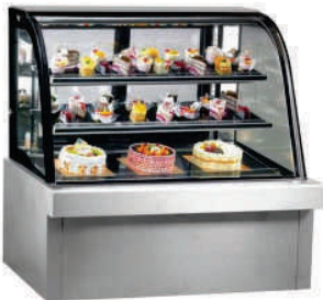
Curved Display Counter