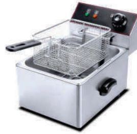
Electric/Gas Single Fryer