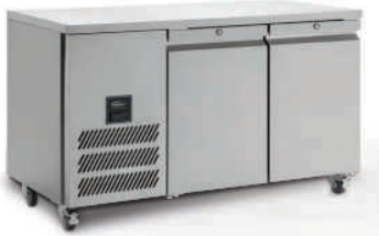
Under Counter Refrigerator