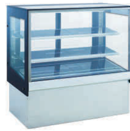
Rectangular Display Counter