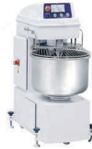
Spiral Mixer (20 to 80 Ltr)