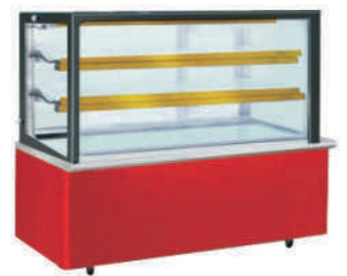
Display Counter With Corian