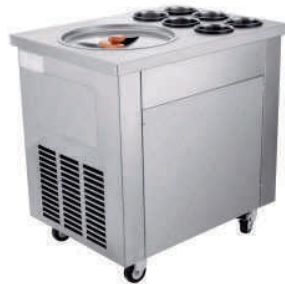
Fried Ice Cream Machine