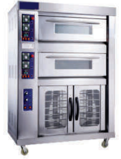
Two Deck Oven With Proofer