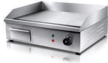
Hot Plate Warmer