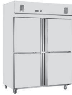
Four Door Refrigerator