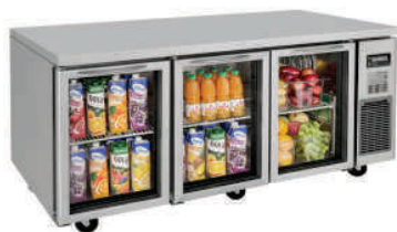
Under Counter Refrigerator