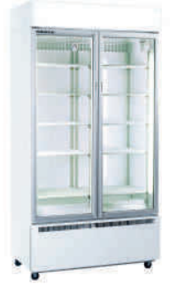
Four Door VISI Coolers