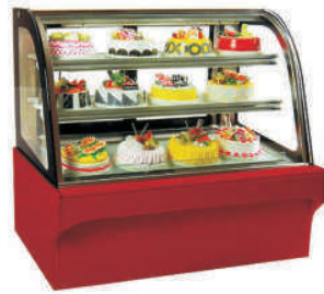
Display Counter With Corian