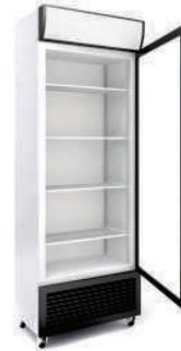
Two Door VISI Coolers