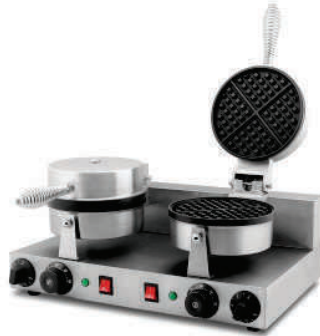
Waffle Machine Double