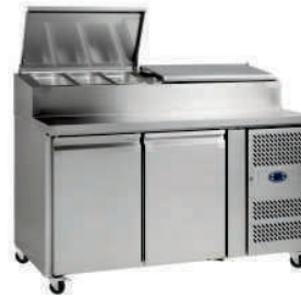
Pizza Make Line