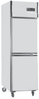
Two Door Refrigerator