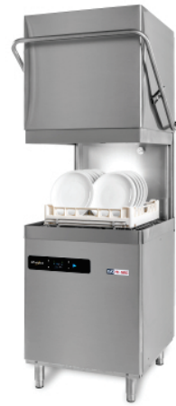
Hood Type Dishwasher