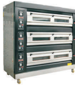
Three Deck Oven