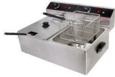
Electric/Gas Double Fryer