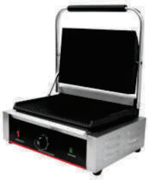
Sandwich Griller Single