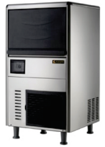
Ice Cube Machine