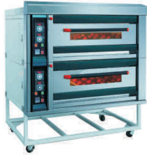
Two Deck Oven