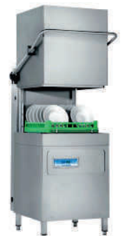
Hood Type Dishwasher