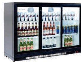
Back Bar Chiller