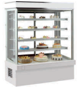
Vertical Cake Showcase