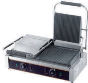
Sandwich Griller Double