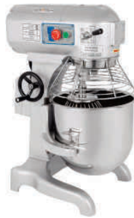
Planetary Mixer (10 to 60 Ltr)