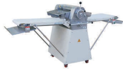
Dough Sheeter Floor Model