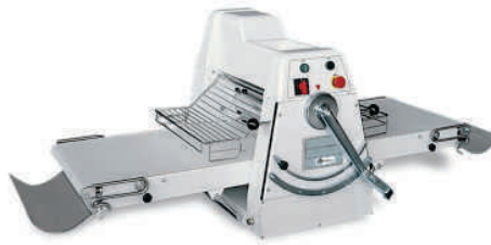
Dough Sheeter Tabletop Model