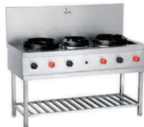
Chinese Burner Range