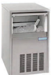
Ice Cube Machine