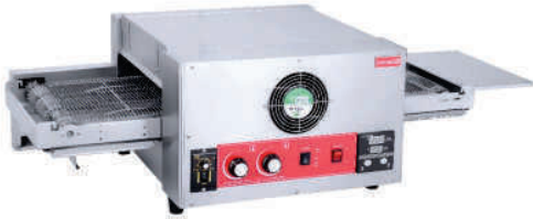
Conveyor Pizza Oven