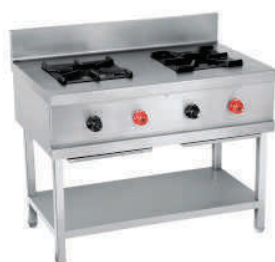
Two Burner Range