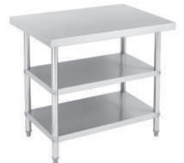
Work Table With Two Shelves