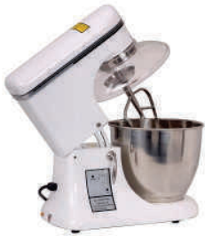
Planetary Mixer (5 To 7 Ltr)