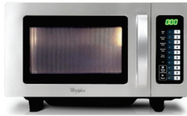
Commercial Microwave Oven