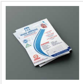
Free Presentation Mockup