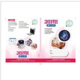
Asta A4 Large File