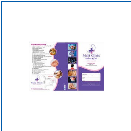
HOSPITAL PLASTIC FILE

Astha A4 Large File, Bifold A4 Mockup, CSSP And Associate A4 Large File, CT MRI Bag, Derma Aura Clinic A4 Large File, Free Presentation Mockup, Hospital Plastic File, Imtiyaz Hospital IPD File, Malhar Hospital A4 Large File, Patient ID Band, TYVEK Wristband, Wristband Single Colour Multicolour, etc.