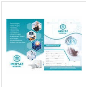
Imtiyaz Hospital IPD File