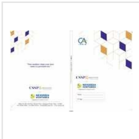
CSSP And Associate A4 Large File