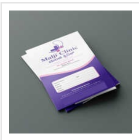
Free Presentation Mockup