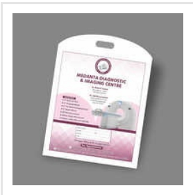
CT MRI Bag