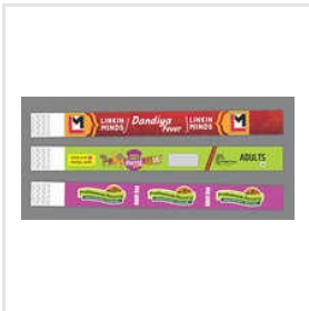
Wristband Single Colour Multicolour