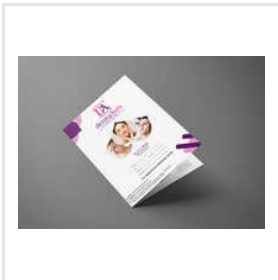
Bifold A4 Mockup