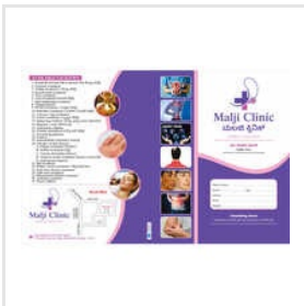
Hospital Plastic File