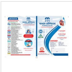
Malhar Hospital A4 Large File