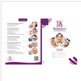
Derma Aura Clinic A4 Large File