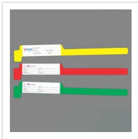
Patient ID Band