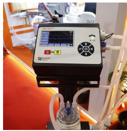
Turbine Based Ventilator Machine