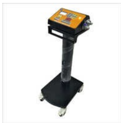
PORTABLE VENTILATOR MACHINE TRANSPORT VENTILATOR FMT 700

Foremost Meditech Anesthesia Ventilator, Foremost Meditech Anesthesia Workstation, ICU Ventilator Machine, Medical Ventilator, Medical Ventilator Machine, Portable Ventilator Machine, Transport Ventilator, Transport ventilator FMT 700, Turbine Based Ventilator Machine, etc.