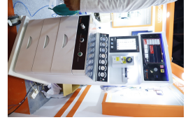
Foremost Meditech Anesthesia