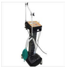
ICU Ventilator Machine