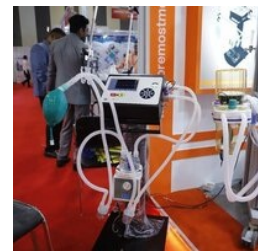
FMT 700 PLUS