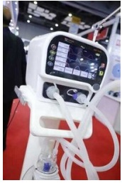
FMT 2100 VENTILATOR