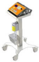
Medical Ventilator Machine