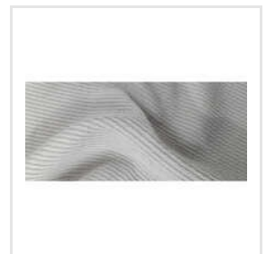
Grey Cotton Rib Knitted Fabric