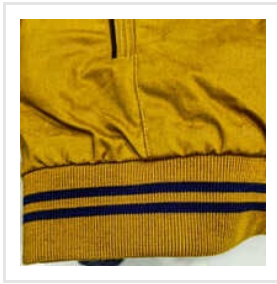
Pentium Lycra Knitted Rib Fabric