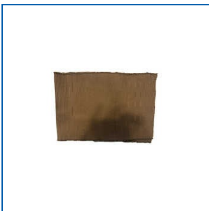
2X1 POLYESTER LYCRA RIB FABRIC TRIPLE TIPPING LYCRA RIB KNITTED FABRIC

2X1 Polyester Lycra Rib Fabric, Bit Design Lycra Rib Knitted Fabrics, Double Tipping Cotton Rib Knitted Fabric, Double Tipping Lycra Rib Knitted Fabric, Double Tipping Polyester Rib Knitted Fabric, Grey Cotton Rib Knitted Fabric, Jacquard Polyester Rib Knitted Fabric, Pentium Lycra Knitted Rib Fabric, Rib Knit Plain Polyester Fabric, Spun Polyester Lycra Knitted Rib Fabric, Triple Tipping Lycra Rib Knitted Fabric, etc.