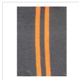
Spun Polyester Lycra Knitted Rib Fabric