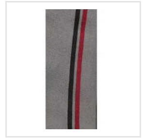
Double Tipping Polyester Rib Knitted