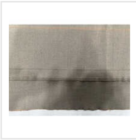
Bit Design Lycra Rib Knitted Fabrics