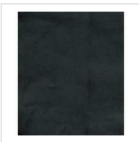
Rib Knit Plain Polyester Fabric