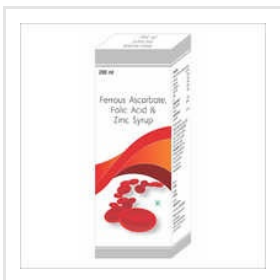
Ferrous Ascorbone -