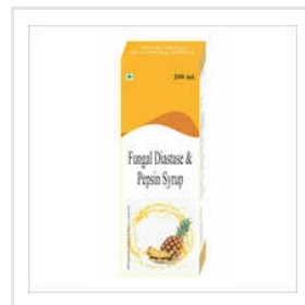
200 MI Fungal Diastase