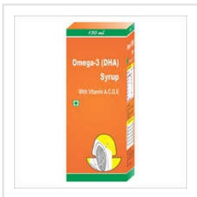
Omega-3 DHA Syrup