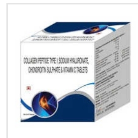
Collagen Peptide Tab