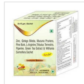
Zinc Ginkgo Biloga