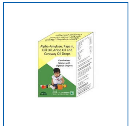
ALPHA AMYLASE PAPAIN DILL OIL DROP