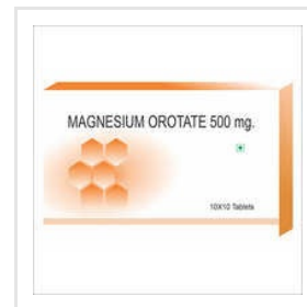
500 Mg Magnesium