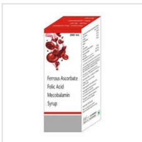
Ferrous Ascorbate Folic