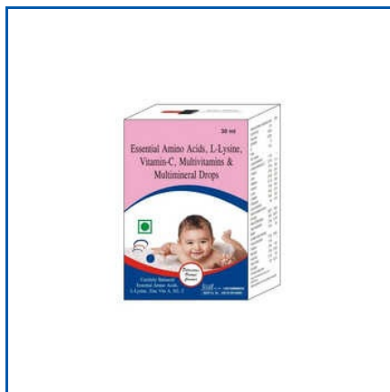
MULTIVITAMIN AND MULTIMINERALS DROPS