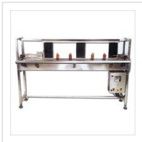
Liquid Eye Inspection Conveyor