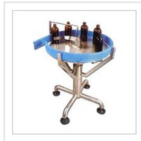
Pharmaceutical Turntable Conveyor