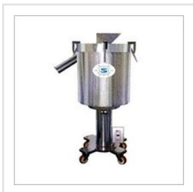
Tablet Deduster Machine