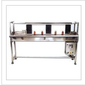
Bottle Inspection Machine