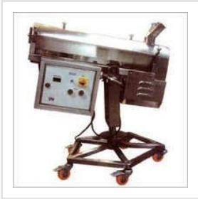
Capsule Polishing Machine