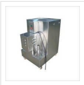
Industrial Dust Extractors