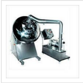
Tablet Coating Machines