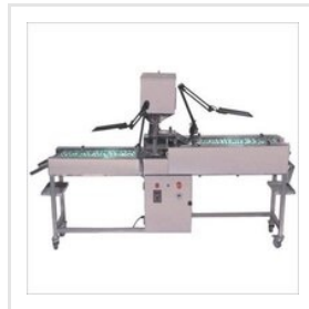
Automatic Tablet Inspection Machine