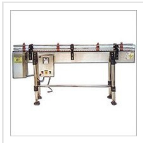
Bottle Transfer Chain Conveyors