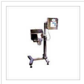
Capsule Metal Detector