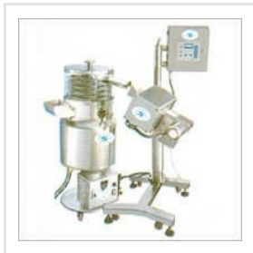
Elevating Deburring With Metal Detector