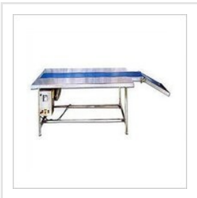
Packing Conveyors With Inclined