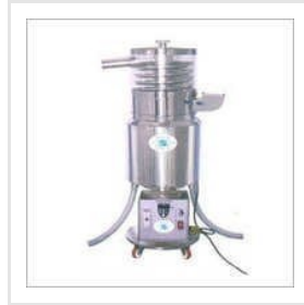
Elevating De-Burring And De-Dusting