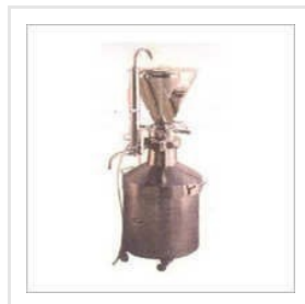
Pharma Colloid Mill