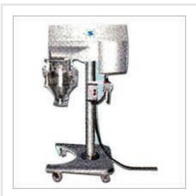
Pharma Multi Mill