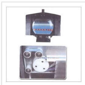
Semi Auto Tablet Inspection Machines