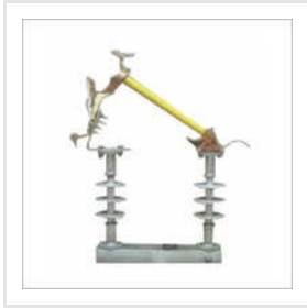
Polymer D.O Fuse