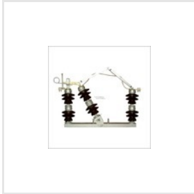
22 KV Gang Operated Air Break Switch