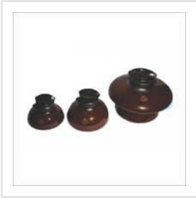
Porcelain Pin Insulator