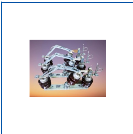
11 KV AIR BREAK SWITCH