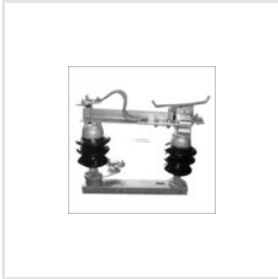
11 KV 400 AMPS, 2 Post Rotating Isolator