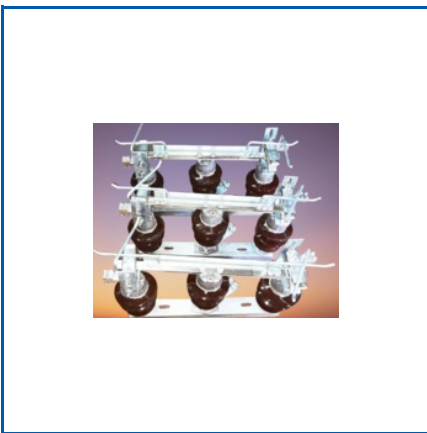
11 KV ROTATING ISOLATOR

11 KV 2 Post Air Break Switch, 11 KV 400 AMPS, 2 Post Rotating Isolator, 11 KV 800 Amps Isolators, 11 KV Air Break Switch, 11 KV Polymer Disc Insulator T And C Type, 11 KV Polymer Double Break Isolator, 11 Kv Double Break Porcelain Isolator, 11 Kv Drop Out Fuse, 11 Kv Pin Insulator, 11 Kv Polymer Drop Out Fuse, 11 Kv Polymer Horn Gap Fuse, 11 Kv Porcelain Horn Gap Fuse, 11 Kv Rotating Isolator, 11KV Polymer Disc Insulator B And S Type, etc.