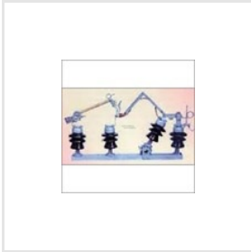
11kv Air Break Switch With D O Fuse