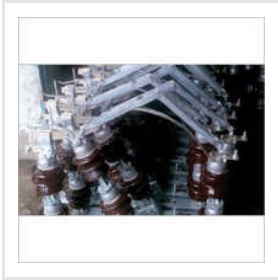
22KV 400 Amps A.B Switch