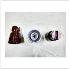
Lt Pin Insulators