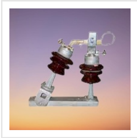
11 KV 2 Post Air Break Switch