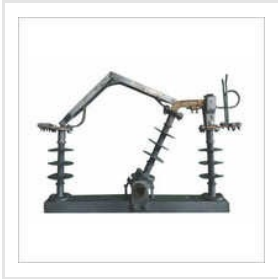
Polymer A.B Switch