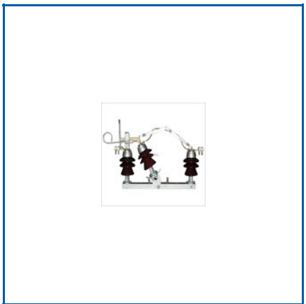
AIR BREAK SWITCH