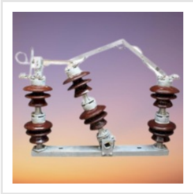
33 KV 400 Amps Air Break Switch