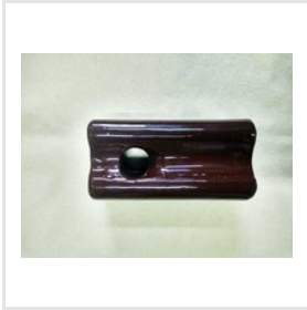
Guy Or Stay Insulator