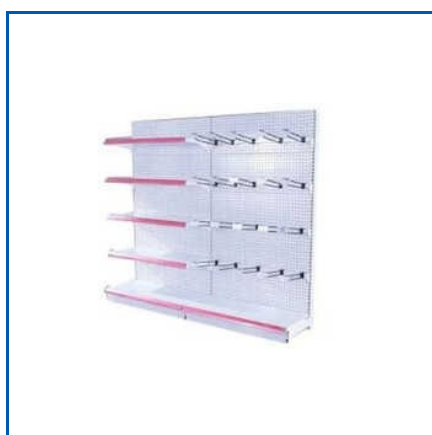
HANGING DISPLAY RACKS

100 Kg Aluminium Partition Rack, 100kg MS Slotted Angle Racks, 2 Seater Mild Blue Steel School Benches Desk, 2 Seater Mild Steel Brown School Benches Desk, 200 Kg SS Pallet Racking Slotted Angle Racks, 250 Kg SS Pallet Racking Slotted Angle Racks, 4 Shelves MS Electronics Wall Display Rack, 4 Shelves Super Market Display Racks, 40kg Mild Steel Color Coated Slotted Angle Rack, 5 Shelves Metal Medicine Display Rack, 5 Shelves Metal Supermarket Display Rack, 5 Shelves Mild Steel Slotted Angle Racks, 5 Shelves SS Glass Display Rack, 5 Shelves Super Market Display Rack, 500 Kg Iron Partition Rack, etc.