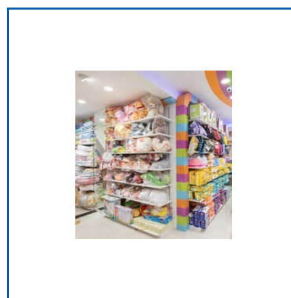
6 SHELVES METAL GIFT SHOP DISPLAY RACK