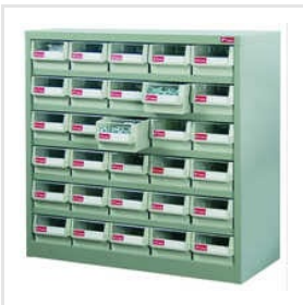
Pharmacy Storage Rack