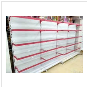
7 Shelves Metal Display Rack