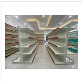
7 Shelves Hypermarket Display Rack