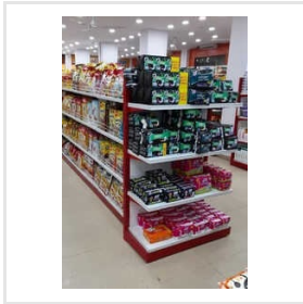
MS Supermarket Display Rack