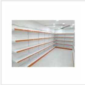
7 Shelves Metal Supermarket Wall