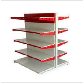
6 Shelves MS Retail Display Rack