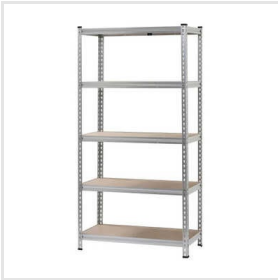
6 Shelves Iron Display Rack