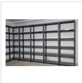
Mild Steel Retail Display Rack