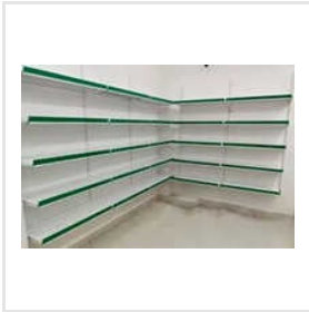
6 Shelves Metal Pharmacy Display