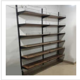
Wall Mount Display Rack