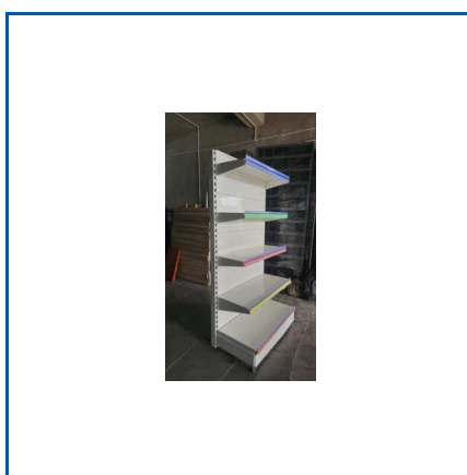
5 SHELVES SUPER MARKET DISPLAY RACK