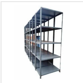
Mild Steel Garment Showroom Display