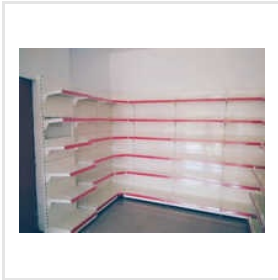
6 Shelves MS Wall Sided Racks