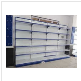
Medical Store Racks