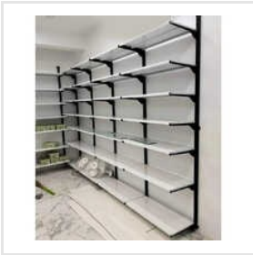
Retail Store Display Rack