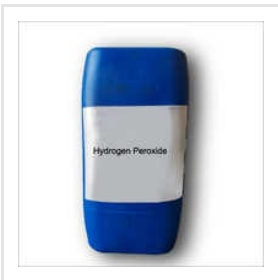
35% Liquid Hydrogen Peroxide