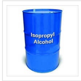
Liquid Isopropyl Alcohol