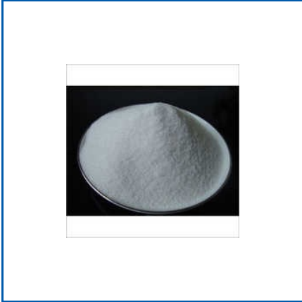
SODIUM SULPHATE POWDER