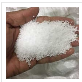
Technical Grade Urea Granules