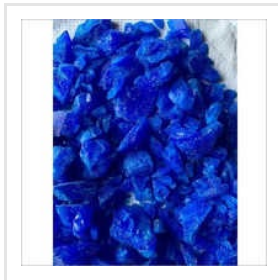
Blue Solid Copper Sulphate Crystal