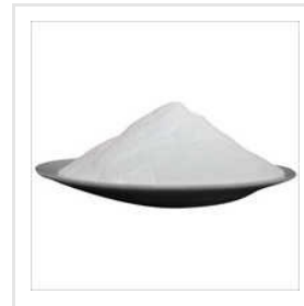
Zinc Sulphate Powder