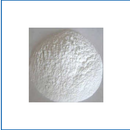
WHITE BLEACHING POWDER

35% Liquid Hydrogen Peroxide, 50% Liquid Hydrogen Peroxide, 85% Liquid Phosphoric Acid, Activated Calcium Carbonate Powder, Ammonium Sulphate Powder, Blue Solid Copper Sulphate Crystal, Citric Acid Powder, Copper Sulphate Crystal Powder, Liquid Isopropyl Alcohol, Liquid Mono Ethylene Glycol, Liquid Nitric Acid, Liquid Sulphuric Acid, Poly Aluminium chloride, Potassium Chloride Powder, Potassium Sulphate Powder, etc.