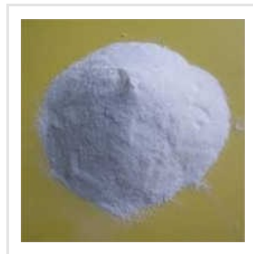
Potassium Sulphate Powder