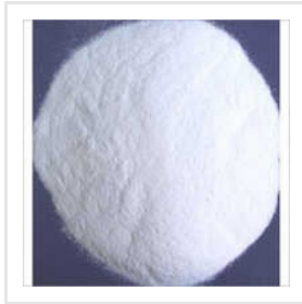
Soda Ash Light Powder