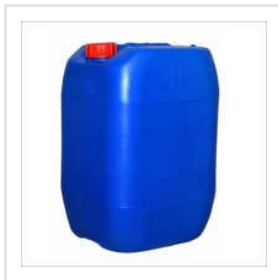
50% Liquid Hydrogen Peroxide