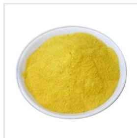
Poly Aluminium Chloride