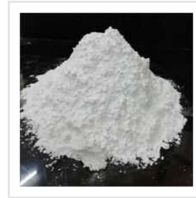
Activated Calcium Carbonate Powder