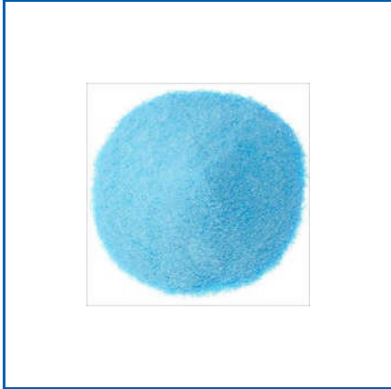
COPPER SULPHATE CRYSTAL POWDER