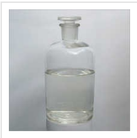
Liquid Nitric Acid