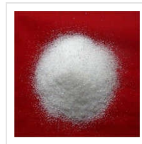
Citric Acid Powder