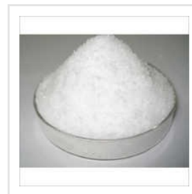
Potassium Chloride Powder