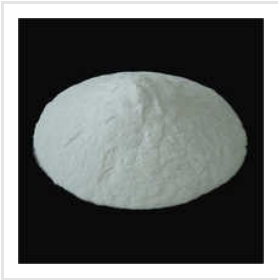
Ammonium Sulphate Powder