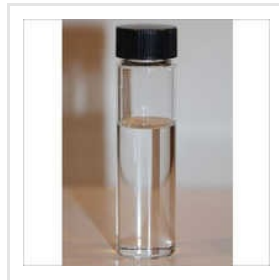
Liquid Mono Ethylene Glycol