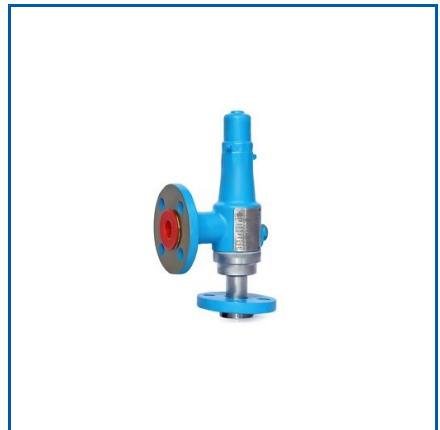
250 MM SAFETY RELIEF VALVE