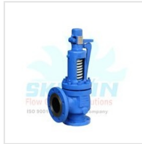
Carbon Steel Water Pressure Relief Valve