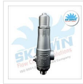
Stainless Steel Thermal Relief Valve