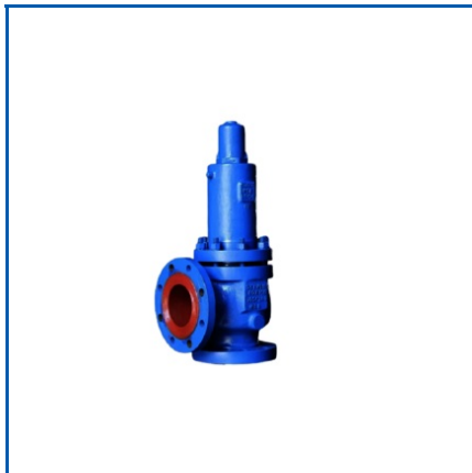
FLANGED END PRESSURE RELIEF VALVE

150 Bar Industrial Safety Relief Valve, 15x25mm Stainless Steel Safety Relief Valve, 24 Inch Stainless Steel Gate Valve, 250 MM Gas Safety Relief Valve, 250 MM Safety Relief Valve, 30 Inch Stainless Steel Swing Check Valve, 50 X 50 mm Safety Relief Valve, Air Safety Relief Valve, Brass Float Type Pressure Reducing Valve, etc.