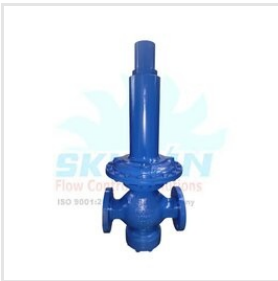
Screwed End Close Bonnet Safety Relief