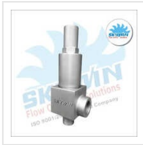
Spring Loaded Safety Relief Valve