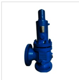
15x25mm Stainless Steel Safety Relief