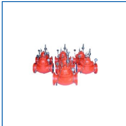
CLOSE BONNET SAFETY RELIEF VALVE