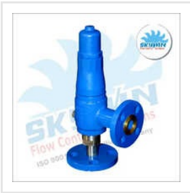
Flanged Safety Relief Valve