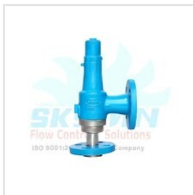
Cast Steel High Pressure Relief Valve