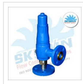
Cast Steel Safety And Pressure Relief Valve