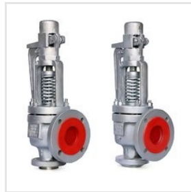
250 MM Gas Safety Relief Valve