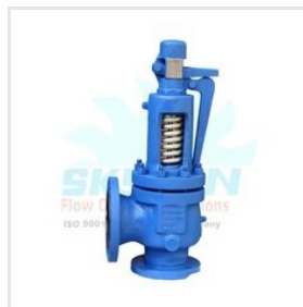
150 Bar Industrial Safety Relief Valve