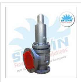
Air Safety Relief Valve