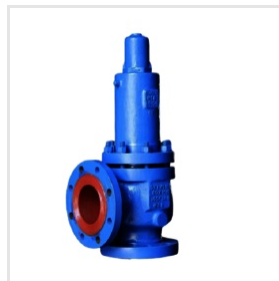
SKYWIN Industrial Safety Relief Valve