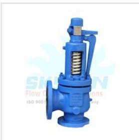
Gas Pressure Safety Valve