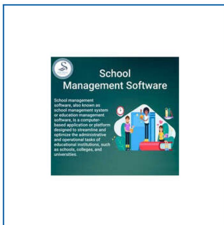
SCHOOL MANAGEMENT SOFTWARE

CRM Management Software, Fingerprint Biometric Machine, Gym Management Software, HR Management Software, Hospital Management Software, Hotel Management Software, Inventory Management Software, Laundry Management Software, Library Management Software, POS Management Software, Pharmacy Management Software, Project Management Software, Restaurant Management Software, School Management Software, etc.