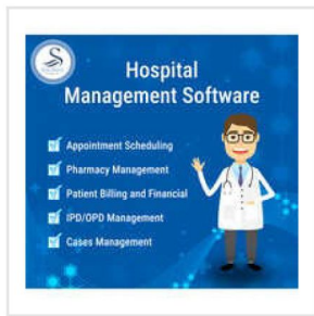
Hospital Management Software