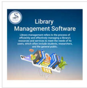
Library Management Software