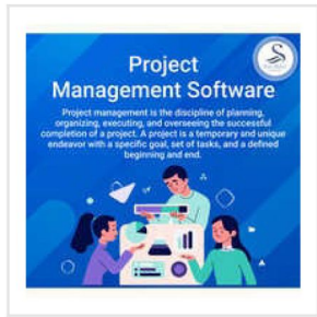
Project Management Software