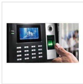
Fingerprint Biometric Machine