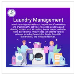
Laundry Management Software