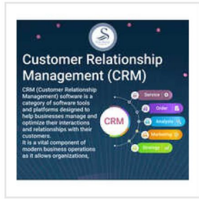
CRM Management Software