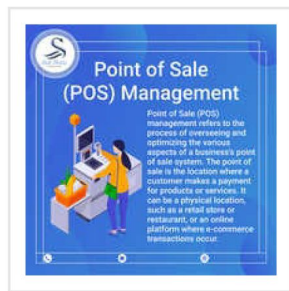
POS Management Software