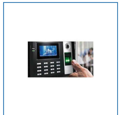
FINGERPRINT BIOMETRIC MACHINE