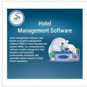
Hotel Management Software