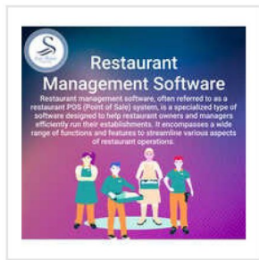
Restaurant Management Software