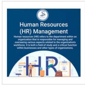
HR Management Software