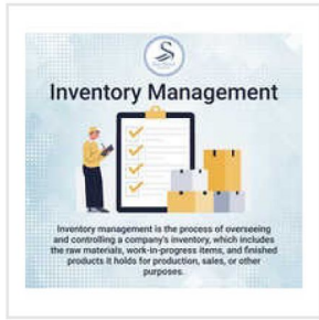
Inventory Management Software