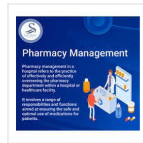
Pharmacy Management Software