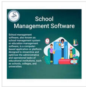
School Management Software